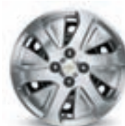
15" Steel with Bolt-On Wheel Cover (LS)