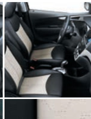
Jet Black Leatherette with Beige Seat Inserts and Beige Dash Trim 4