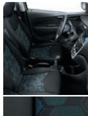
Jet Black Cloth 3 (Dash Trim available on 1LT in Piano Black, White, Beige or Blue)