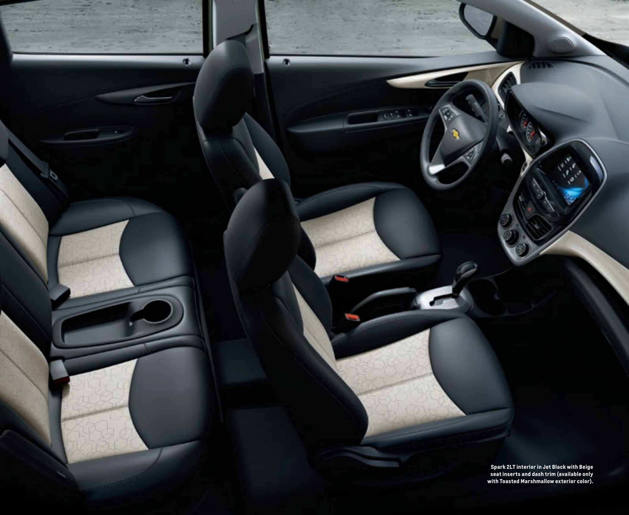
Spark 2LT interior in Jet Black with Beige seat inserts and dash trim (available only with Toasted Marshmallow exterior color).