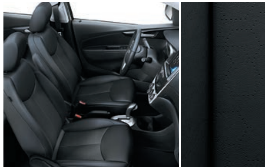
Jet Black Leatherette with Piano Black Dash Trim 2 (Dash Trim also available in White)