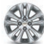
15" Silver-Painted Alloy (LT)