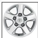
Available 5-spoke aluminum alloy wheel