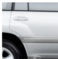
Natural White with Ivory or Shadow Gray Interior