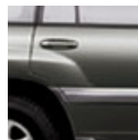
Riverrock Green Mica with Ivory or Shadow Gray Interior