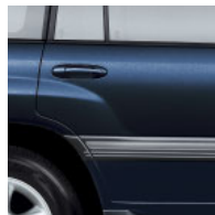
Atlantis Blue Mica with Ivory or Shadow Gray Interior