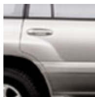
CHampagne Pearl with Ivory or Shadow Gray Interior