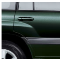
Imperial Jade Mica with Ivory or Shadow Gray Interior