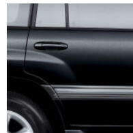
Black with Ivory or Shadow Gray Interior