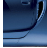
Spectra Blue Mica with Black fabric or Black leather interior