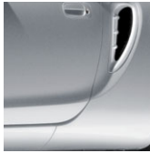
Silver Streak Mica with Gray or Black fabric or Black leather interior