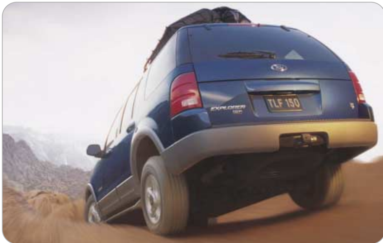
EXPLORER XLT 4X4, SHOWN WITH LOAD WARRIOR ACCESSORY.

The completely redesigned 2002 Explorer unites utility and agility with a completely redesigned rear suspension system and frame design – a combination that makes the ride smoother and the performance tighter and more responsive on-road and off-road. With its innovative (and patented) “porthole frame” design, Explorer now has an independent rear suspension rather than a solid rear axle – a feature you won’t find on our major competitors. The new system absorbs chunky road bumps to smooth out your ride. That feels good. So does this: It also helps optimize tire-to-pavement contact, and communicates important steering feedback to the driver, which both improve controllability.