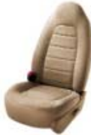
CLOTH CAPTAIN'S CHAIRS IN MEDIUM PARCHMENT OR GRAPHITE. STANDARD ON XLS.