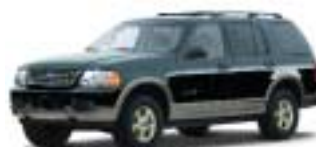
EXPLORER EDDIE BAUER