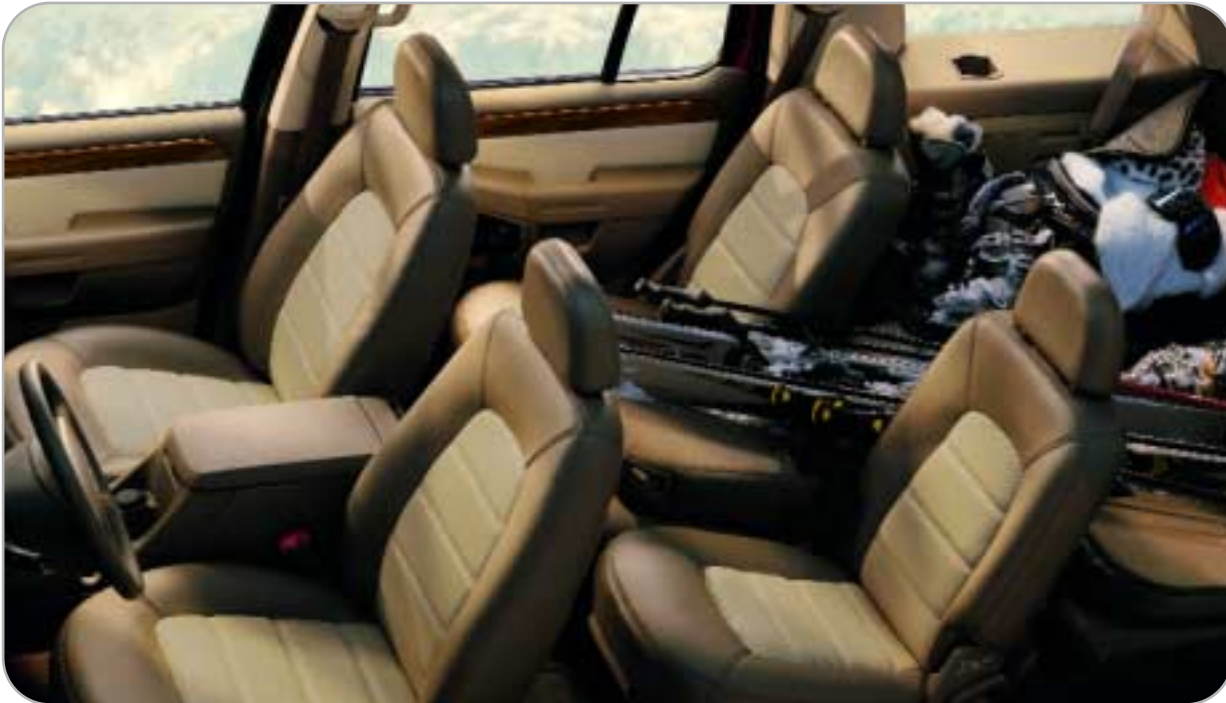
EXPLORER EDDIE BAUER IN MEDIUM PARCHMENT LEATHER TRIM WITH OPTIONAL THIRD-ROW SEAT.