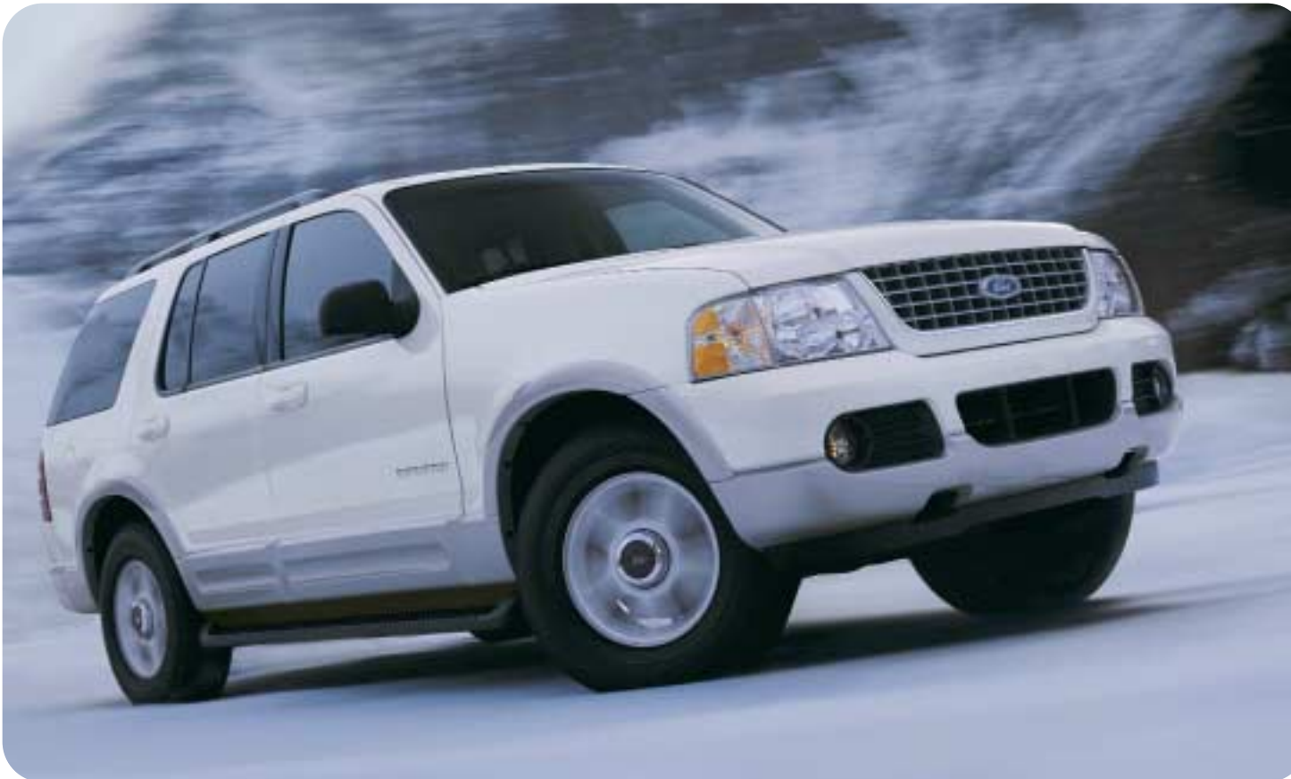
EXPLORER LIMITED 4X4 IN WHITE PEARL TRI-COAT METALLIC CLEARCOAT WITH SILVER FROST ACCENTS.

Breathe deeply. And remember: You got here in the completely redesigned 2002 Ford Explorer. Now more capable than ever, Explorer opens up new territory for you. It has higher ground clearance, and more generous angles of approach and departure to make it more capable off-road. The step-in height is lower, so you can get in and out more easily. The optional third-row seat folds right into the floor – so loading cargo is easy. Loading passengers is easy too, since Explorer offers the most third-row headroom and legroom in its class.