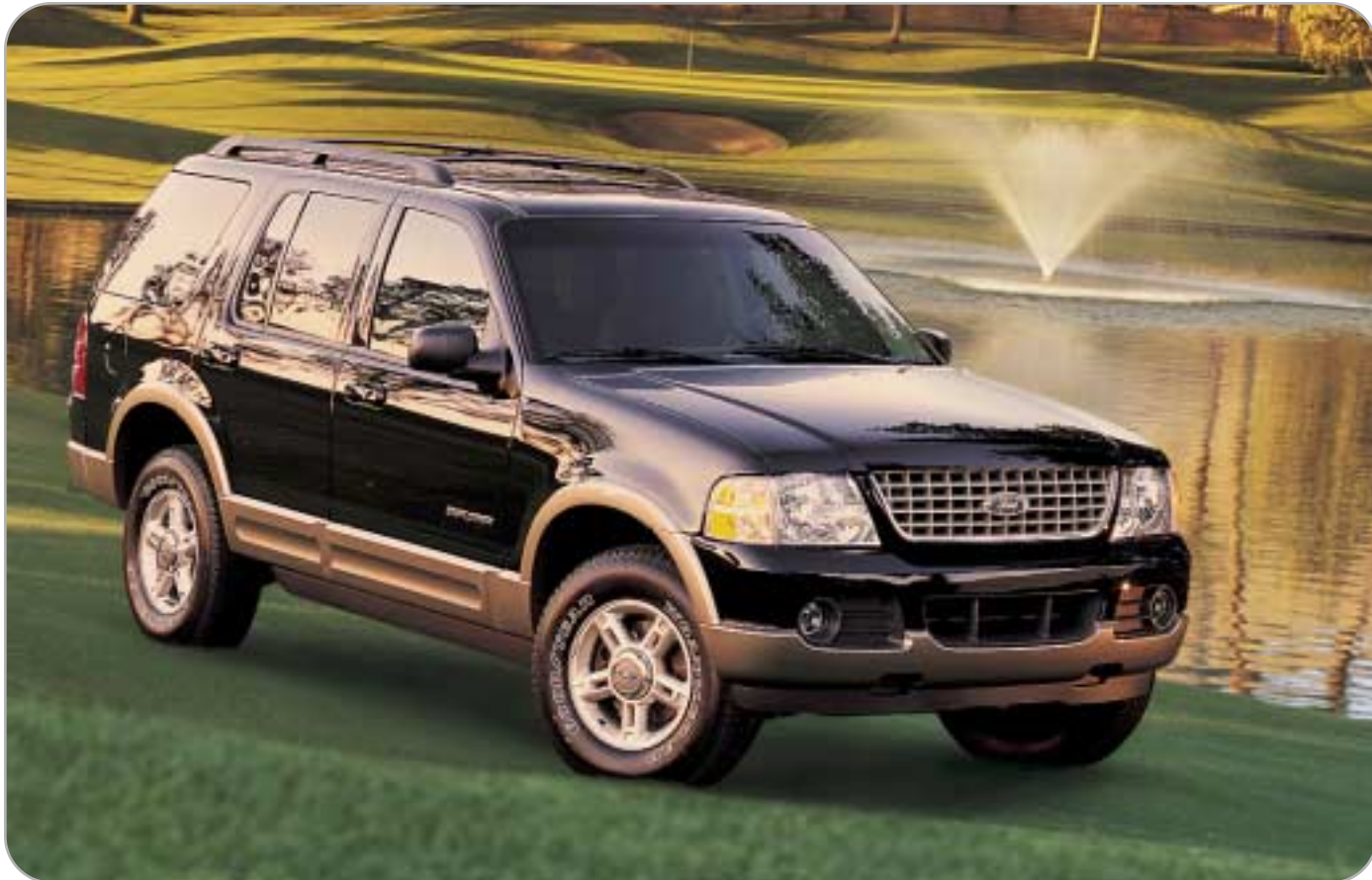
EXPLORER EDDIE BAUER 4X4 IN BLACK CLEARCOAT.