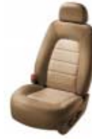
LUXURY LEATHER-TRIMMED BUCKET SEATS IN MEDIUM PARCHMENT. STANDARD ON EDDIE BAUER.