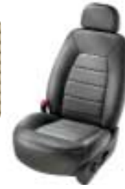
LUXURY LEATHER-TRIMMED BUCKET SEATS IN MEDIUM PARCHMENT OR MIDNIGHT GREY. STANDARD ON LIMITED.