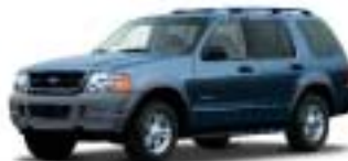
EXPLORER XLS SPORT