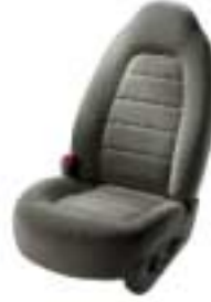
CLOTH SPORT BUCKET SEATS IN MEDIUM PARCHMENT OR GRAPHITE. STANDARD ON XLT. ALSO AVAILABLE WITH LEATHER TRIM ON XLT.