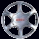
17" 6-Lug High-Performance Polished Aluminum Wheels