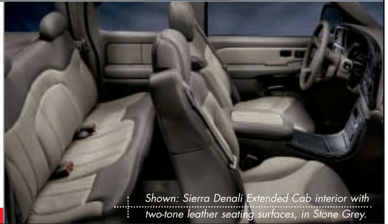
Shown: Sierra Denali Extended Cab interior with two-tone leather seating surfaces, in Stone Grey.

The Sierra® Denali® is a superb example of GMC® innovation in action. It offers a combination of technical features that work in concert to provide you with exceptional driving control: A specially engineered Vortec™ 6000 V8 engine, heavy-duty transmission, full-time all-wheel drive, 17-inch wheels with Michelin® tires, and the breakthrough technology of QuadraSteer.™