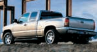
Shown: Sierra Denali Extended Cab, in Pewter Metallic

A LESSON IN TRUCKS FROM THE PEOPLE WITH 100 YEARS OF PURE TRUCK EXPERIENCE.