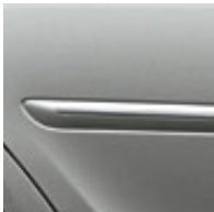
Lunar Mist Metallic with Stone (LE/XLE) or Charcoal (SE) Interior