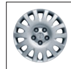
XLE 16" steel wheel with full wheel cover — standard on XLE