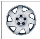
SE 16" steel wheel with full wheel cover — standard on SE