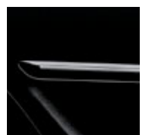
Black with Stone or Taupe (LE/XLE) or Charcoal or Taupe (SE) Interior

Leather trim available on SE V6 and XLE models.