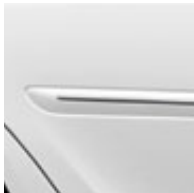
Super White with Stone or Taupe (LE/XLE) or Charcoal or Taupe (SE) Interior