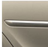
Desert Sand Mica with Taupe (LE, SE, XLE) Interior