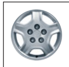
LE 15" aluminum alloy wheel — available on LE and LE V6