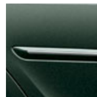
Aspen Green Pearl with Stone or Taupe (LE/XLE) or Charcoal or Taupe (SE) Interior