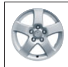
SE 16" aluminum alloy wheel — available on SE, standard on SE V6