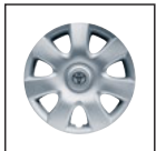
LE 15" steel wheel with full wheel cover — standard