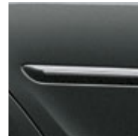
Phantom Gray Pearl with Stone or Taupe (LE/XLE) or Charcoal or Taupe (SE) Interior