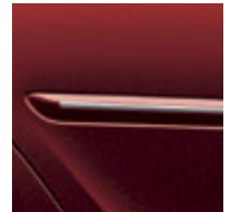
Salsa Red Pearl with Stone or Taupe (LE/XLE) or Charcoal or Taupe (SE) Interior