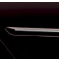
Black Walnut Pearl with Stone or Taupe (LE/XLE) or Charcoal or Taupe (SE) Interior