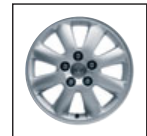
XLE 16" aluminum alloy wheel — available on XLE, standard on XLE V6