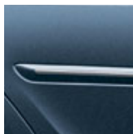
Catalina Blue Pearl with Stone or Taupe (LE/XLE) or Charcoal or Taupe (SE) Interior