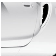
Super White with Black or Red cloth or Tan leather interior