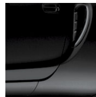
Black with Black or Red cloth or Tan leather interior

*See Specifications page for more information on Toyota's Supplemental Restraint System (SRS).