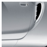
Liquid Silver Metallic with Black or Red cloth or Tan leather interior