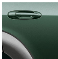
Imperial Jade Mica with Charcoal or Oak interior SR5 with Thunder Gray trim