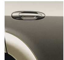
Thunder Gray Metallic with Charcoal or Oak interior SR5 with Warm Silver Trim