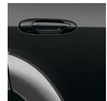
Black with Charcoal or Oak interior SR5 with Thunder Gray trim