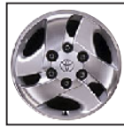
SR5 available 5-spoke aluminum alloy wheel