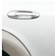
Natural White with Charcoal or Oak interior SR5 with Warm Silver trim