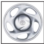
SR5 standard styled steel wheel