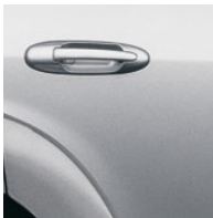
Silver Sky Metallic with Charcoal interior SR5 with Silver Sky trim