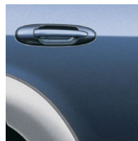
Blue Marlin Pearl 1 with Charcoal or Oak interior SR5 with Silver Sky trim