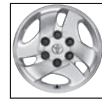
Limited Standard split 3-spoke aluminum alloy wheel