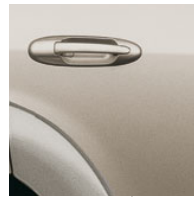
Desert Sand Mica 1 with Oak interior SR5 with Warm Silver trim