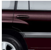
BLACK GARNET PEARL WITH IVORY OR SHADOW GRAY INTERIOR