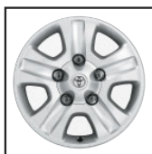
Standard 17" 5-spoke aluminum alloy wheel