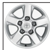
Available 18" 5-spoke aluminum alloy wheel