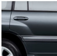
GALACTIC GRAY WITH SHADOW GRAY INTERIOR