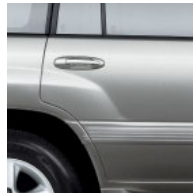
Thunder Cloud Metallic WITH SHADOW GRAY INTERIOR