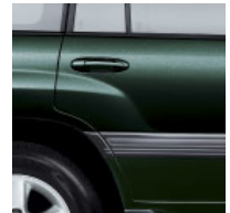
Imperial Jade Mica WITH IVORY INTERIOR