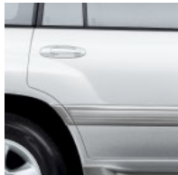
Natural White WITH IVORY OR SHADOW GRAY INTERIOR