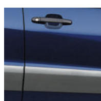
Spectra Blue Mica 2 with Gray interior