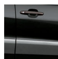
Black with Gray or Taupe 4 interior