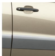
Vintage Gold Metallic 1, 2 with Taupe 4 interior