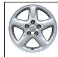
Available 5-spoke aluminum alloy wheel 3