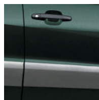
Rainforest Pearl 2 with Gray or Taupe 4 interior