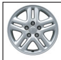
Available split 5-spoke aluminum alloy wheel 2