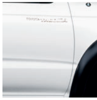
Super White 1,2,3 with Charcoal or Oak interior