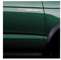
Imperial Jade Mica 1,2,3 with Charcoal or Oak interior