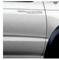
Lunar Mist Metallic 1 with Charcoal interior