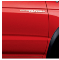
Radiant Red 3 with Charcoal or Oak interior