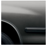
Phantom Gray Pearl with Light Charcoal, 1 Oak or Gray 1 interior