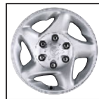
SR5 available 16" 5-spoke aluminum alloy wheel