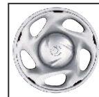
Limited standard/ SR5 available 17" split 5-spoke aluminum alloy wheel