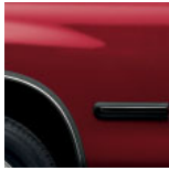
Salsa Red Pearl with Light Charcoal, 1 Oak or Gray 1 interior