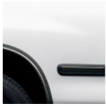
Natural White with Gray, 1 Light Charcoal 1 or Oak interior