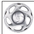
SR5 standard 16" styled steel wheel