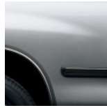
Silver Sky Metallic 2 with Gray or Light Charcoal interior