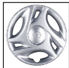
Regular Cab available 16" full wheel cover