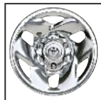
SR5 available 16" chrome clad styled steel wheel