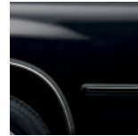
Black with Gray, 1 Light Charcoal 1 or Oak interior