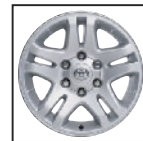
SR5 available 17" split 5-spoke graphite-toned aluminum alloy wheel 2