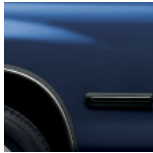
Stratosphere Mica with Gray or Light Charcoal interior