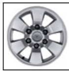
SR5 Standard 6-spoke 16" aluminum alloy wheel