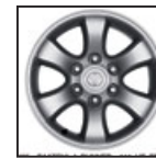
Sport Edition standard 6-spoke 17" aluminum alloy wheel