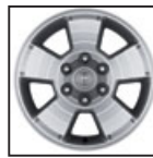
SR5 available 5-spoke 17" aluminum alloy wheel Limited standard 5-spoke 17" aluminum alloy wheel