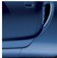
Spectra Blue Mica with Black fabric or Black leather interior