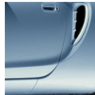
Paradise Blue Metallic with Black fabric or Tan leather interior