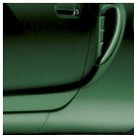
Electric Green Mica with Black fabric or Tan leather interior