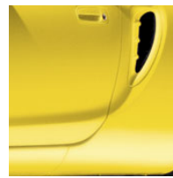
Solar Yellow with Black fabric or Black leather interior