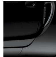
Black with Gray or Black fabric or Black leather interior