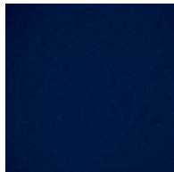
Stratosphere Mica 6, 7 with Dark Gray or Light Charcoal interior