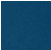
Blue Marlin Pearl 6 with Dark Gray, 5 Light Charcoal 7 or Oak interior