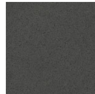
Phantom Gray Pearl with Dark Gray, 7 Light Charcoal 7 or Oak interior