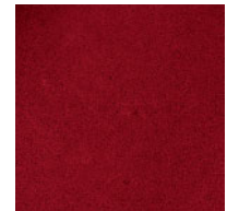
Salsa Red Pearl with Dark Gray, 7 Light Charcoal 7 or Oak interior