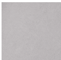
Silver Sky Metallic 8 with Dark Gray or Light Charcoal interior