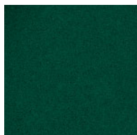
Imperial Jade Mica with Dark Gray, 7 Light Charcoal 7 or Oak interior