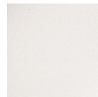
Natural White with Dark Gray, 7 Light Charcoal 7 or Oak interior