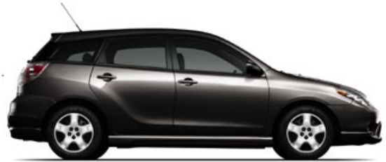
XR 2WD 4-Speed Automatic (1912) MSRP** Starting At: $17,570.00