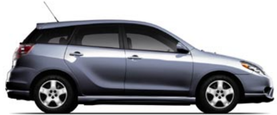
2WD 4-Speed Automatic (1902) MSRP** Starting At: $16,060.00