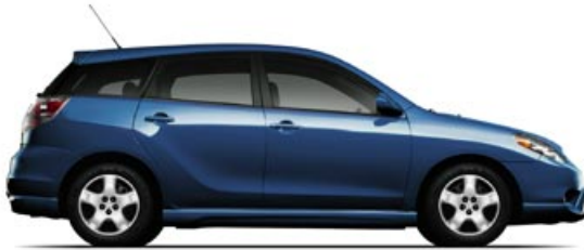
XR 2WD 5-Speed Manual (1911) MSRP** Starting At: $16,740.00