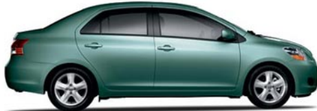
4-Door Sedan 4-Speed Automatic (1442) MSRP* Starting At: $12,550.00