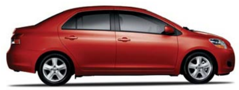
4-Door Sedan 5-Speed Manual (1441) MSRP* Starting At: $11,825.00