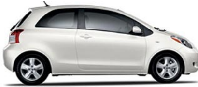
3-Door Liftback 5-Speed Manual (1421) MSRP* Starting At: $10,950.00