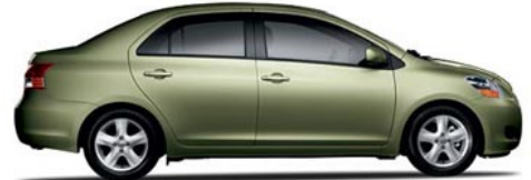
4-Door S Sedan 4-Speed Automatic (1452) MSRP* Starting At: $14,050.00