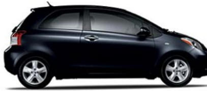
3-Door Liftback 4-Speed Automatic (1422) MSRP* Starting At: $11,850.00