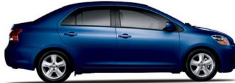
4-Door S Sedan 5-Speed Manual (1451) MSRP* Starting At: $13,325.00