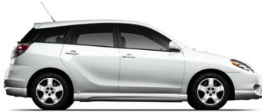
2WD 5-Speed Manual (1901) MSRP** Starting At: $15,510.00