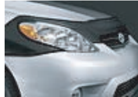
Front End Mask $88.00