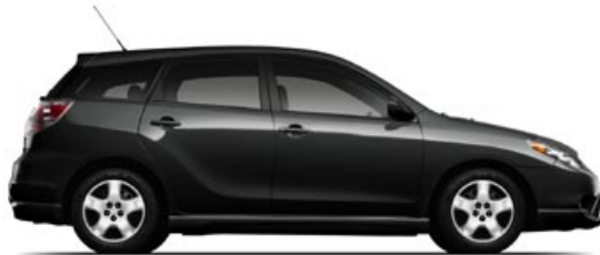
XR 2WD 5-Speed Manual (1911) MSRP** Starting At: $16,990.00