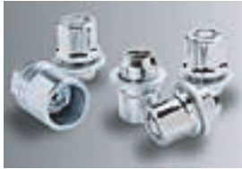
Alloy Wheel Locks $65.00