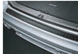
Rear Bumper Protector $58.00