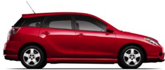
2WD 4-Speed Automatic (1902) MSRP** Starting At: $16,310.00