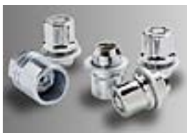
Wheel Locks $79.00 Installed MSRP*