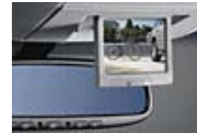
Back-Up Camera w/Monitor $695.00 Installed MSRP*