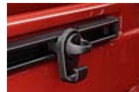
Mini Tie Down w/Hook (set of two) $45.00 Installed MSRP*