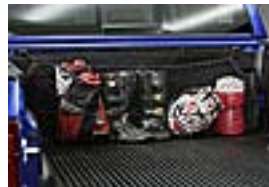
Cargo Net Exterior $49.00 Installed MSRP*