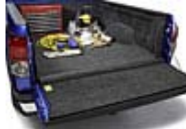
Bed Rug Short Bed $409.00 Regular Bed $419.00 Long Bed $434.00 Parts Only MSRP**