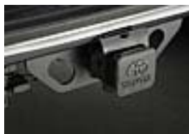
Tow Hitch w/Wire Harness $820.00 w/o Wire Harness $485.00 Installed MSRP*