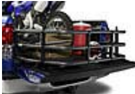
Bed Extender $320.00 Installed MSRP*