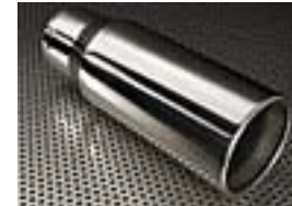
Exhaust Tip 4.7L $69.00 5.7L $79.00 Installed MSRP*