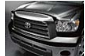
Hood Protector $165.00 Installed MSRP*