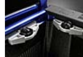
Deck Rail Systems w/4 Cleats Short/Regular Bed $210.00 Long Bed $220.00 Installed MSRP*