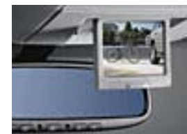
Back-Up Camera w/Monitor $695.00 Installed MSRP*