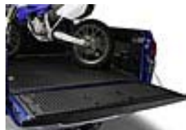
Bedliner w/Deck Rails Short/Regular Bed $345.00 Long Bed $375.00 Installed MSRP*