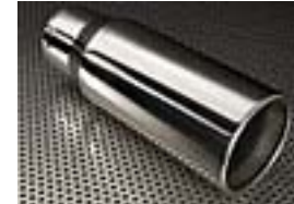
Exhaust Tip 4.7L $69.00 5.7L $79.00 Installed MSRP*