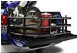
Bed Extender $320.00 Installed MSRP*