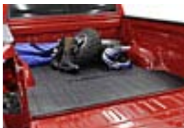
Bed Mat Short/Regular Bed $127.00 Long Bed $137.00 Installed MSRP*