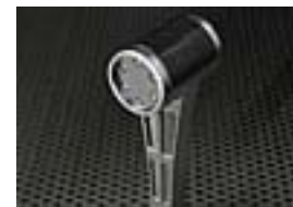
Anodized Aluminum Shift Knob $85.00 Installed MSRP*