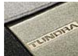
Carpet Floor Mats w/Door Sill Protector Regular Cab $111.00 Double Cab $178.00 CrewMax $181.00 Installed MSRP*