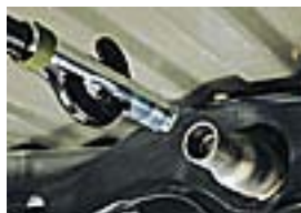
Spare Tire Lock $73.00 Installed MSRP*