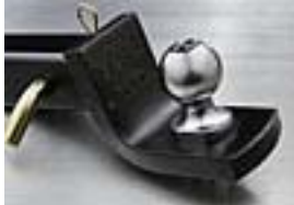
Ball Mounts $29.00 Parts Only MSRP**