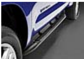
Tube Steps Chrome $519.00 Black $475.00 Installed MSRP*