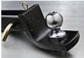
Ball Mounts $29.00 Parts Only MSRP**