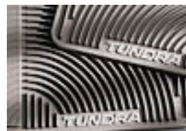
All Weather Mats Regular Cab $55.00 Double/CrewMax $99.00 Installed MSRP*