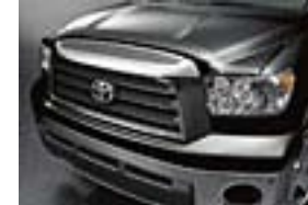
Hood Protector $165.00 Installed MSRP*