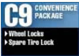
Convenience Package $152.00 Installed MSRP*

These exterior accessories are also available: • License Plate Frame Bracket