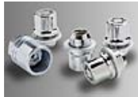
Wheel Locks $79.00 Installed MSRP*