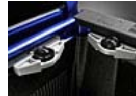
Deck Rail Systems w/4 Cleats Short/Regular Bed $210.00 Long Bed $220.00 Installed MSRP*