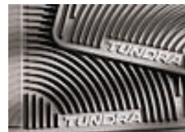
All Weather Mats and Door Sill Protector Regular Cab $94.00 Double Cab $162.00 CrewMax $214.00 Installed MSRP*