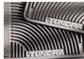
All Weather Mats and Door Sill Protector Regular Cab $94.00 Double Cab $162.00 CrewMax $214.00 Installed MSRP*