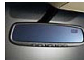
Auto Dimming Mirror $280.00 Installed MSRP*