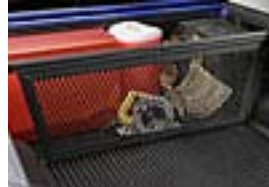
Cargo Divider $330.00 Installed MSRP*