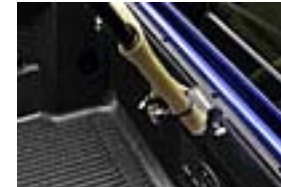
Locking Bike Fork Attachment $95.00 Installed MSRP*