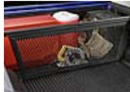
Cargo Divider $330.00 Installed MSRP*