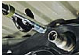
Spare Tire Lock $73.00 Installed MSRP*