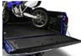
Bedliner w/o Deck Rails Short/Regular Bed $325.00 Long Bed $355.00 Installed MSRP*