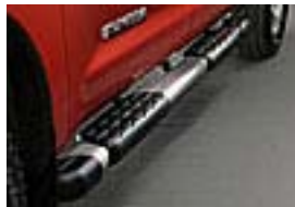
Stepboards Brushed Stainless Steel Regular Cab $475.00 Double Cab $589.00 CrewMax $589.00 Installed MSRP*