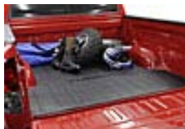
Bed Mat Short/Regular Bed $127.00 Long Bed $137.00 Installed MSRP*