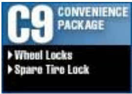
Convenience Package $152.00 Installed MSRP*

These exterior accessories are also available: • License Plate Frame Bracket