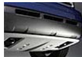
Front Skid Plate $425.00 Installed MSRP*