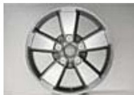
Carve 20" Alloy Wheel $2,200.00 Installed MSRP*