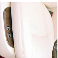
EXTENDED FRONT SEAT CUSHION**