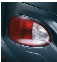
BODY COLOURED LAMP BEZELS