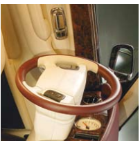
BAROQUE WHITE PVC/TONE HIDE TRIMMED INTERIOR SHOWN IS BURGUNDY AND MACRANOLA HIDE WITH BURIRWALNUT VENEER