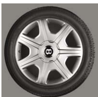
17" X 8 7 SPOKE ALUMINUM ALLOY