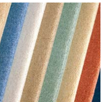
CARPETS MATCHED TO CUSTOMER COLOUR SPECIFICATION