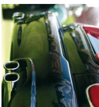
REAR SPORTS BUMPER AND QUAD EXHAUST TAILPIPS