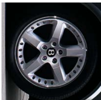
17" X 8 13 SPOKE 3-PIECE SPORTS BLADE ALUMINUM ALLOY (FRONT)