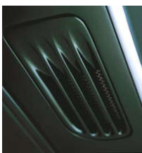
LOWER FRONT WING VENT

*Not all features shown are available on all cars