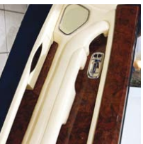
VENEERED DOOR PANELS

*Average only. †Not available in the USA. Not all features shown are available on Aeneas