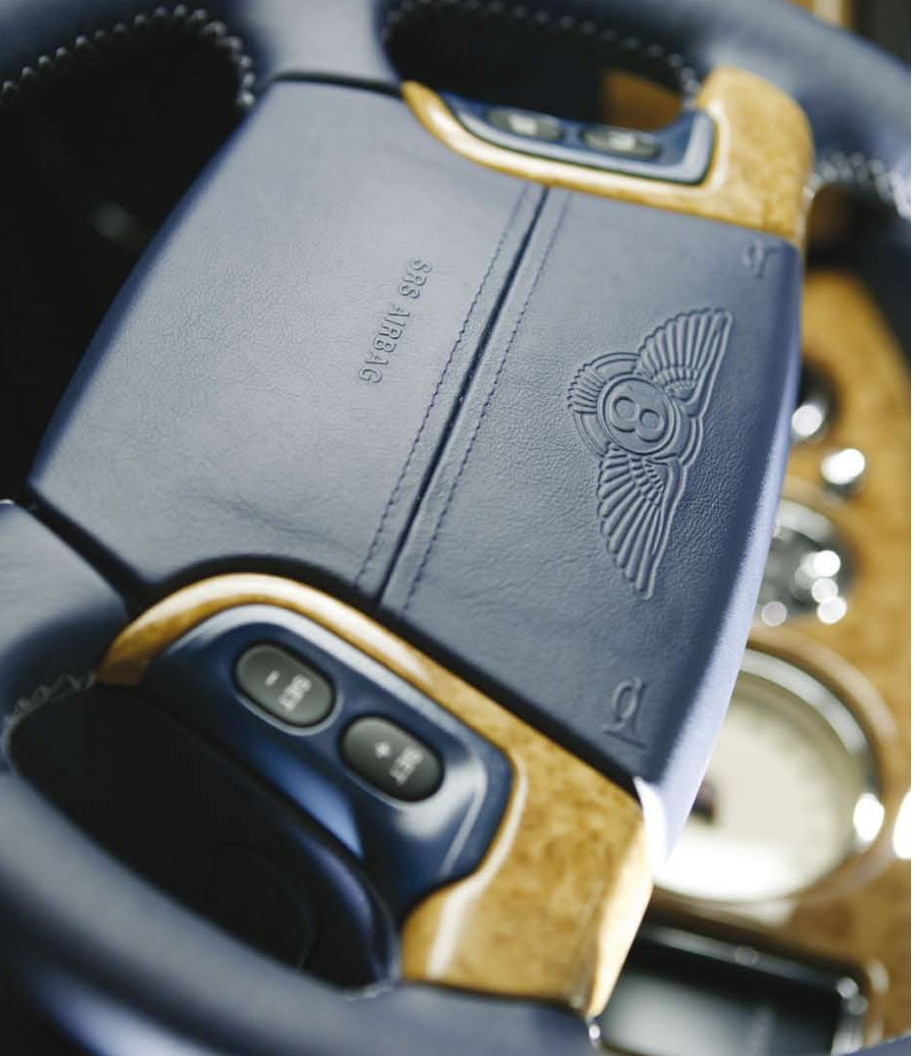
VENEER SURROUND TO CRUISE CONTROL SWITCHES