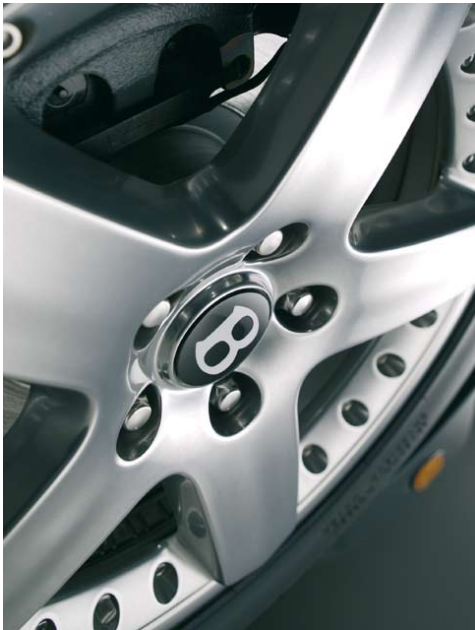
17" X 8 3 SPOKE 3-PIECE STAR ALUMINUM ALLOY (POLISHED)