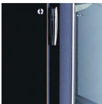
FINE LINES TO EXTERIOR BODYWORK