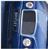
DIAMOND PAINT COMBINATION