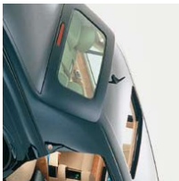
REAR COMPARTMENT ELECTRIC SUNROOF* (M.O.S.O.)