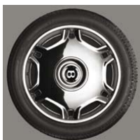
17" X 8 6 TWIN SPOKE DISC ALUMINUM ALLOY (CHROME)