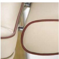
CONTRAST PIRING TO HEADREST AND SEAT