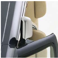
CHROME MIRROR CAPS