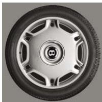
17" X 8 6 TWIN SPOKE DISC ALUMINUM ALLOY