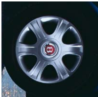
18" X 8 3 SPOKE CHROME FLARED ALUMINUM ALLOY