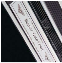
PERSONALISED TREAD PLATE PLAQUE