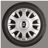
17" X 8 12 SPOKE ALUMINUM ALLOY