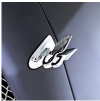
RETRACTABLE WING B RADIATOR MASCOT