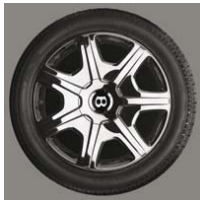
17" X 8 7 SPOKE CHROME FLARED ALUMINUM ALLOY