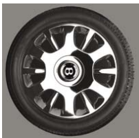
17" X 8 12 SPOKE CHROME FLARED ALUMINUM ALLOY