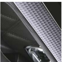
ENGINE TURNED ALUMINIUM INSERTS TO MATCH PAINT