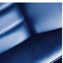
HIDE MATCHED TO CUSTOMER COLOUR SPECIFICATION