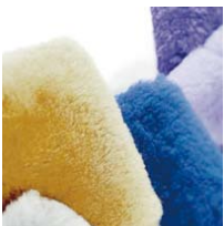
LAMBSWOOL RUGS MATCHED TO CUSTOMER COLOUR SPECIFICATION*