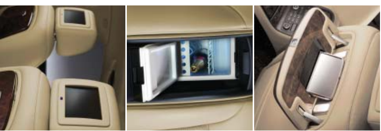
Top: Rear vanity mirrors within picnic tables Centre: Refrigerated bottle cooler Bottom: Rear entertainment package