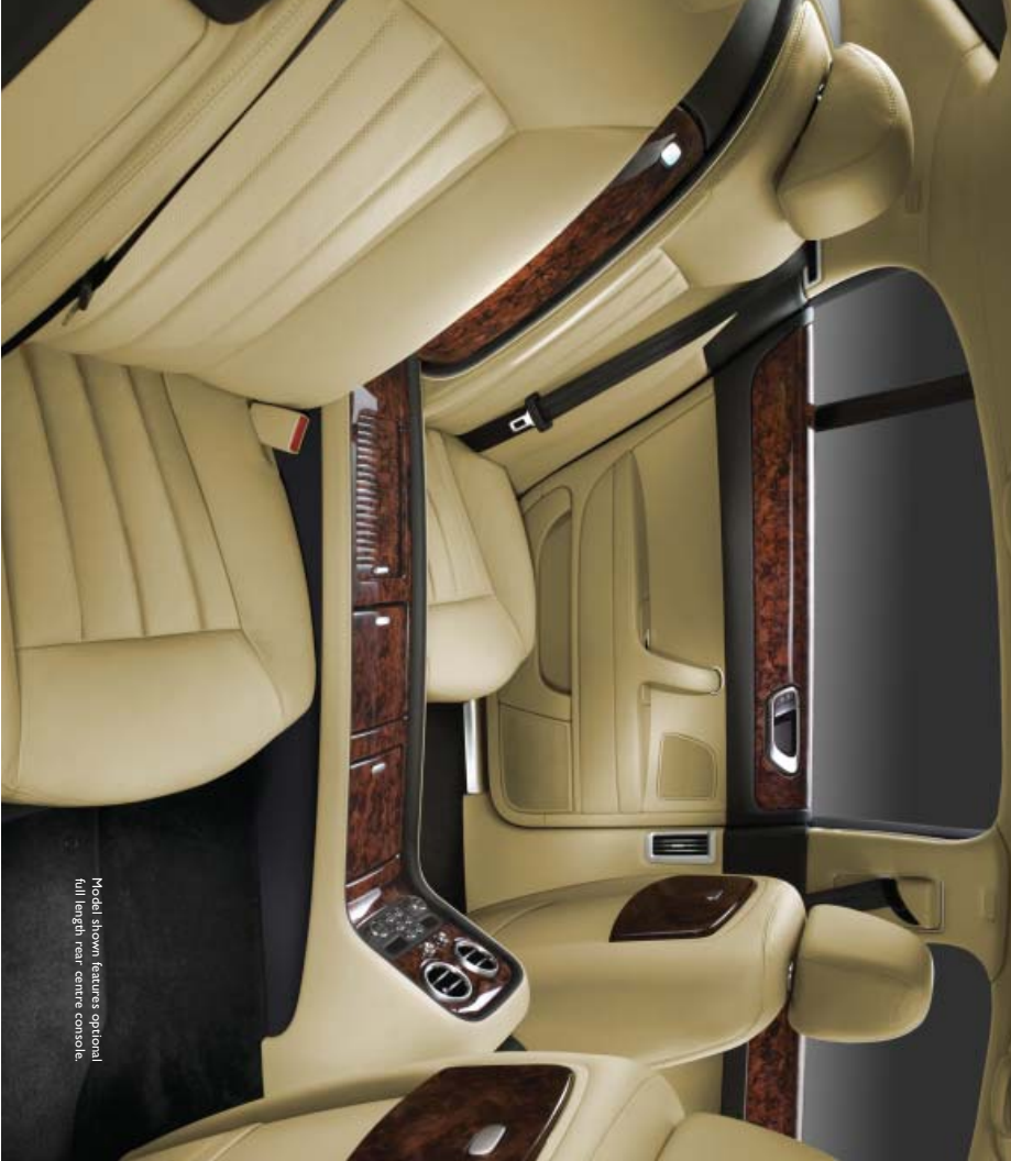
Model shown features optional full length rear centre console.