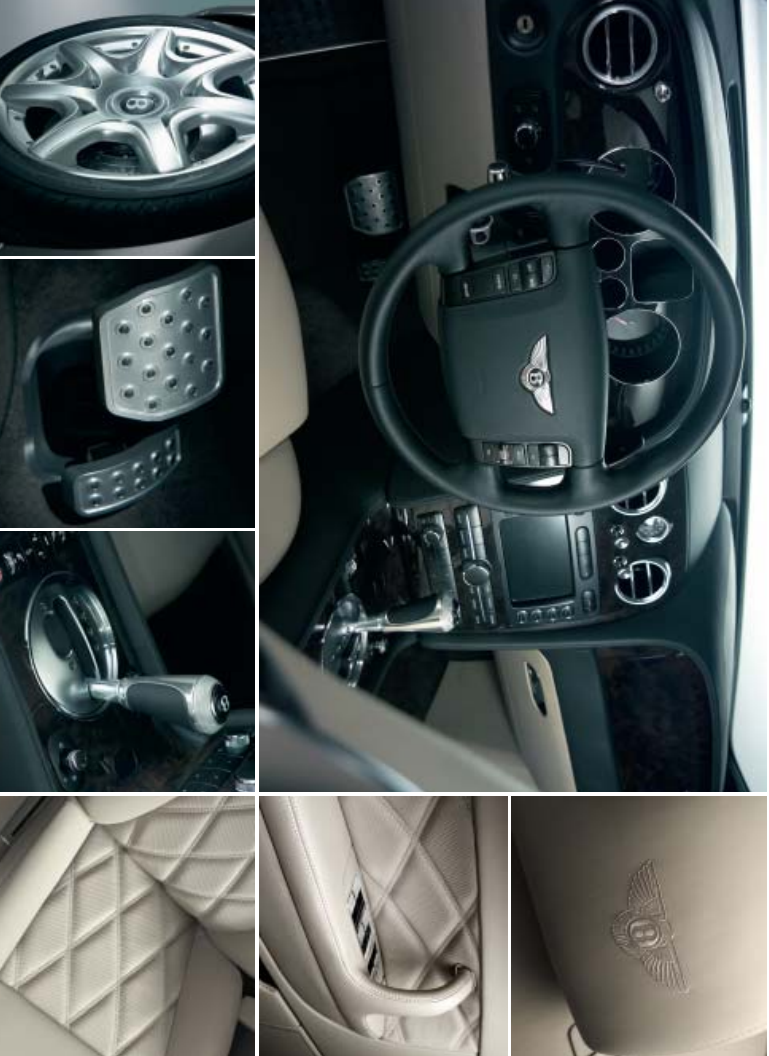
Clockwise: Dark Stained Burr Walnut veneer, embroidered Bentley emblem to headrests, diamond quilted hide to door panels, diamond quilted hide to seat facings, sporting gear lever, drilled alloy sport foot-pedals, 20" 2-piece alloy sports wheels.