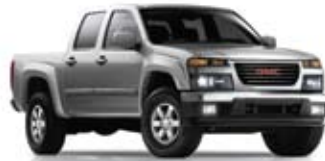
DARK STEEL GRAY METALLIC**