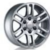
P67 □ 18" □ ALUMINUM WITH BRIGHT FINISH