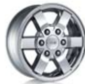
RP1 □ 16" □ CHROME CLAD