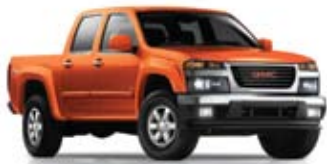
RED-ORANGE METALLIC EXTRA-COST COLOR