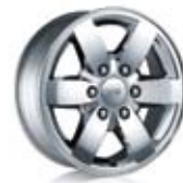
R03 □ 17" □ CHROME CLAD