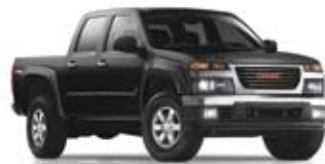
CARBON BLACK METALLIC** EXTRA-COST COLOR