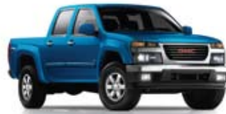
AQUA BLUE MARINE