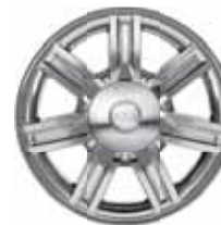
18" 7-SPOKE CHROME-CLAD ALUMINUM AVAILABLE WITH VOGA PACKAGE

Mercury uses clearcoat paint for beauty and protection. All exterior paints are Metallic except for White Suede. Colors are representative only.