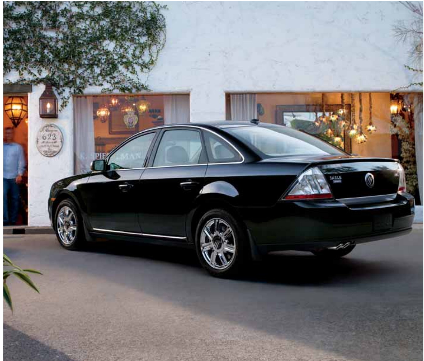
SABLE PREMIER IN TUXEDO BLACK METALLIC WITH AVAILABLE EQUIPMENT.