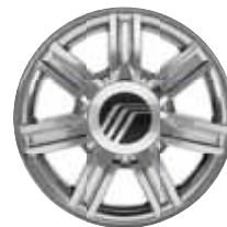
18" 7-SPOKE CHROME-CLAD ALUMINUM AVAILABLE ON PREMIER