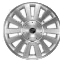
17" 7-SPOKE BRIGHT-ALUMINUM STANDARD ON SABLE

Garmin is a registered trademark of Garmin Ltd.