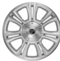
18" 7-SPOKE BRIGHT-ALUMINUM STANDARD ON PREMIER