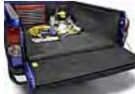
Bed Rug $419.00 Parts Only MSRP**