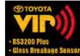
VIP Security Systems RS3200 Plus $299.00 Installed MSRP* Glass Breakage Sensor $165.00 Installed MSRP*