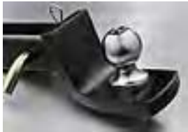
Ball Mounts $65.00 Parts Only MSRP**