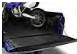
Bedliner w/o Deck Rails Short/Regular Bed $345.00 Long Bed $375.00 Installed MSRP*