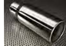
Exhaust Tip $75.00 Installed MSRP*