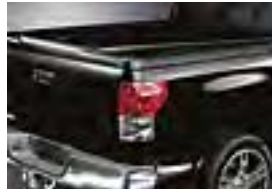
Tonneau Cover Short Bed $1545.00 Standard Bed $1575.00 Installed MSRP*