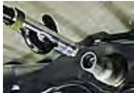
Spare Tire Lock $73.00 Installed MSRP*