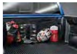
Cargo Net Exterior $49.00 Installed MSRP*