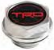
TRD Forged Oil Cap $45.00 Parts Only MSRP**