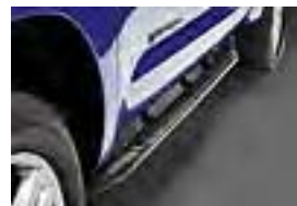
Tube Steps Black $490.00 Installed MSRP*

These exterior accessories are also available: • License Plate Frame Bracket