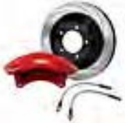
TRD High Performance Brake Kit $2,895.00 Installed MSRP*