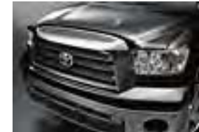
Hood Protector $165.00 Installed MSRP*