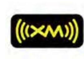
XM Satellite Radio $449.00 Installed MSRP*