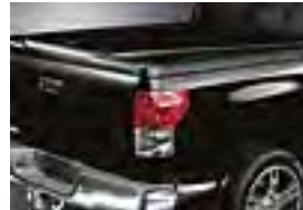
Tonneau Cover Short Bed $1545.00 Standard Bed $1575.00 Installed MSRP*