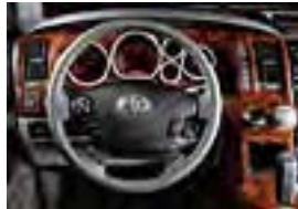
Molded Simulated Burlwood Dash Applique by Superior Dash Regular Cab $340.00 Double/CrewMax $350.00 Installed MSRP*