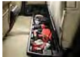
Underseat Storage $125.00 Installed MSRP*