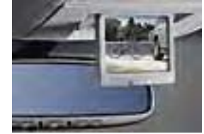
Back-Up Camera w/Monitor $695.00 Installed MSRP*