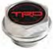
TRD Forged Oil Cap $45.00 Parts Only MSRP**