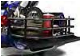
Bed Extender $320.00 Installed MSRP*