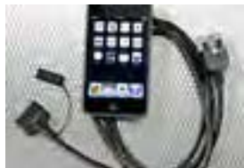
Interface Kit for iPod® $299.00 Installed MSRP*