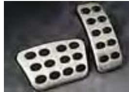
Sport Pedal Stainless Steel Automatic $85.00 Installed MSRP*