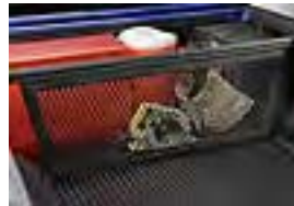
Cargo Divider $345.00 Installed MSRP*