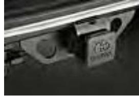
Tow Hitch w/Wire Harness $920.00 w/o Wire Harness $520.00 Installed MSRP*