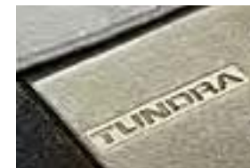
Carpet Floor Mats w/Door Sill Protector Regular Cab $111.00 Double Cab $178.00 Crew Cab $181.00 Installed MSRP*