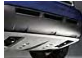
Front Skid Plate $425.00 Installed MSRP*