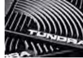
All Weather Mats Regular Cab $55.00 Double/Crew Cab $99.00 Installed MSRP*