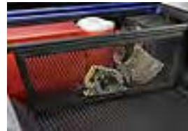
Cargo Divider $345.00 Installed MSRP*