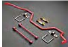
TRD Rear Sway Bar $299.00 Installed MSRP*