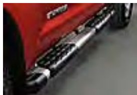
Stepboards Brushed Stainless Steel Regular Cab $475.00 Double Cab $624.00 CrewMax $624.00 Installed MSRP*