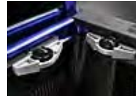
Deck Rail Systems w/4 Tie Down Cleats Short/Regular Bed $210.00 Long Bed $220.00 Installed MSRP*