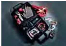
Emergency Assistance Kit $70.00 Installed MSRP*