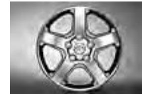
Machine Star 5 Spoke 20" Alloy Wheel $1,695.00 Installed MSRP*