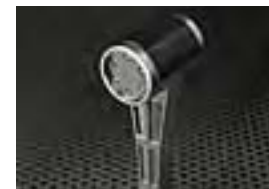
Anodized Aluminum Shift Knob $85.00 Installed MSRP*