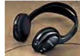
Wireless Headphones $41.00 Parts Only MSRP**