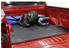
Bed Mat Short/Regular Bed $127.00 Long Bed $137.00 Installed MSRP*