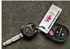
Remote Engine Start $529.00 Installed MSRP*