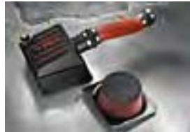
TRD Performance Air Intake $475.00 Parts Only MSRP**