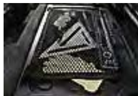
Seat Back Cargo Net $64.00 Installed MSRP*