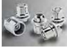
Wheel Locks $81.00 Installed MSRP*