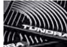
All Weather Floor Mats and Door Sill Protector Regular Cab $94.00 Double Cab $162.00 Crew Max $165.00 Installed MSRP*