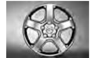
Machine Star 5 Spoke 20" Alloy Wheel $1,695.00 Installed MSRP*