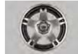
TRD 22" X9" 5-Spoke Polished Forged Aluminum Alloy Wheel $4,699.00 Installed MSRP*