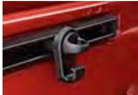
Mini Tie Down w/Hook (set of two) $45.00 Installed MSRP*