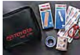
First Aid Kit $29.00 Installed MSRP*