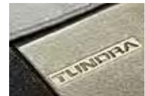
Carpet Floor Mats w/Door Sill Protector Regular Cab $111.00 Double Cab $178.00 Crew Cab $181.00 Installed MSRP*