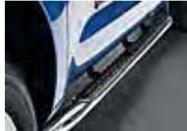
Tube Steps Chrome $534.00 Installed MSRP*