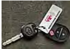
Remote Engine Start $529.00 Installed MSRP*