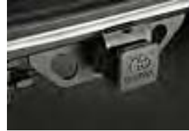
Tow Hitch w/Wire Harness $920.00 w/o Wire Harness $520.00 Installed MSRP*