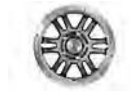
TRD 17" x 8" 6 Split Spoke Forged Off Road Wheel with beadlock styling $3,199.00 Installed MSRP*