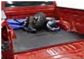
Bed Mat Short/Regular Bed $127.00 Long Bed $137.00 Installed MSRP*