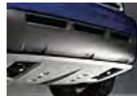
Front Skid Plate $425.00 Installed MSRP*