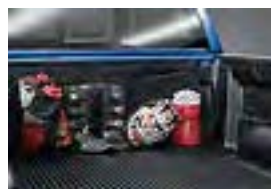
Cargo Net Exterior $49.00 Installed MSRP*