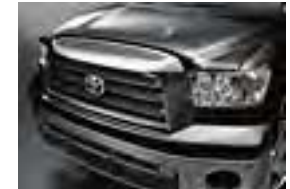
Hood Protector $165.00 Installed MSRP*