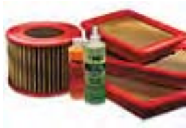
TRD Performance Air Filter $90.00 Installed MSRP*

These exterior accessories are also available: • TRD Performance Handling Kit