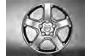
Machine Star 5 Spoke 20\"/>