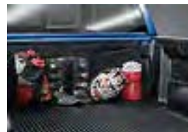
Cargo Net Exterior $49.00 Installed MSRP*