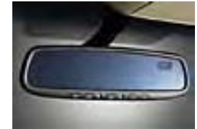
Auto Dimming Mirror $280.00 Installed MSRP*