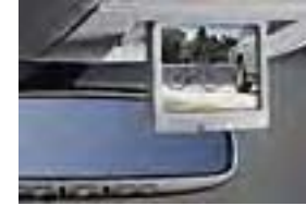
Back-Up Camera w/Monitor $695.00 Installed MSRP*