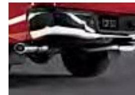
TRD Cat-Back Exhaust System $1,065.00 Installed MSRP*