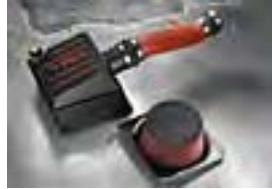
TRD Performance Air Intake $475.00 Parts Only MSRP**