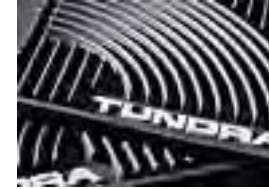
All Weather Mats Regular Cab $55.00 Double/Crew Cab $99.00 Installed MSRP*