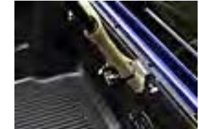
Locking Bike Fork Attachment $95.00 Installed MSRP*