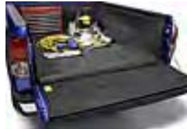
Bed Rug $419.00 Parts Only MSRP**