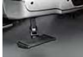
Bed Step $300.00 Installed MSRP*