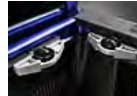
Deck Rail Systems w/4 Tie Down Cleats Short/Regular Bed $210.00 Long Bed $220.00 Installed MSRP*