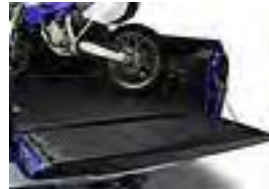
Bedliner w/Deck Rails Short/Regular Bed $365.00 Long Bed $395.00 Installed MSRP*