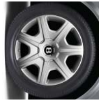
17" 7-SPoke ALUMINUM ALLOY (PAINTED)