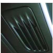
LOWER FRONT WING VENT

We believe there is always room for that personal touch. When it comes to exterior tailoring you have a wealth of additions available to you. Free your imagination.