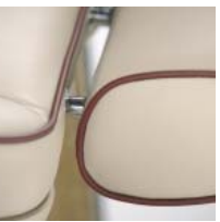
CONTRAST PIPING TO HEADREST AND SEAT