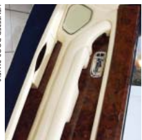
VENERED DOOR PANELS