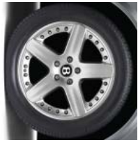
17" 5-SPoke 2-PIECE STAR ALUMINUM ALLOY (POLISHED)