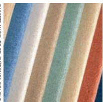
CARPETS MATCHED TO CUSTOMER COLOUR SPECIFICATION