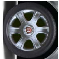
18" 5-SPoke ALUMINUM ALLOY (CHROME)

0 Available as a cost feature (consult your dealer for more details) ● Standard feature (only very limited quantities available) † Price on application, ‡ - Average T: R - Average R: RL - Average RL: A - Average A: B - Bentley Production.