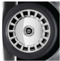
17" 4-SPoke DISC ALUMINUM ALLOY (PAINTED)