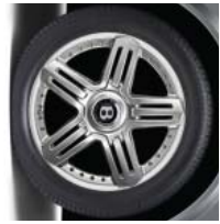
20" 7-SPoke 2-PIECE ALUMINUM ALLOY (PAINTED)