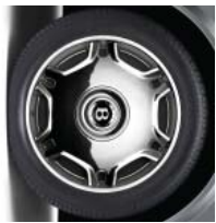
17" 6-TWIN-SPoke DISC ALUMINUM ALLOY (CHROME)