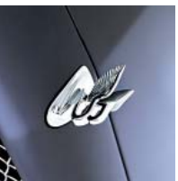
RETRACTABLE FLYING B® RADIATOR MASCOT (PAINTED MATCHORSHELL)