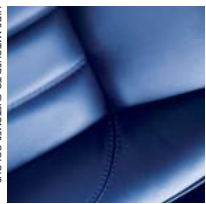
HIDES MATCHED TO CUSTOMER COLOUR SPECIFICATION