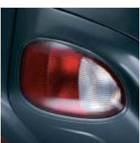
BODY COLOURED LAMP BEZELS

0 Available as a cost feature (consult your dealer for more details) ● Standard feature (only very limited quantities available) † Price on application, ‡ - Average T: R - Average R: RL - Average RL: A - Average A: B - Bentley Production.