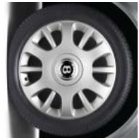
17" 13-SPoke ALUMINUM ALLOY (PAINTED)