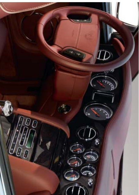
REWOOD LEATHER HIDE WITH CHOCOLATE SANDWICH TRIMMING