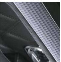
ENGINE-TURNED ALUMINIUM INSERTS TO WAIST RAILS