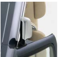
CHROME DOOR MIRROR CAPS