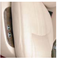
EXTENDED FRONT SEAT CUSHION