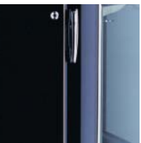
FINE LINES TO EXTERIOR BODYWORK