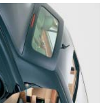
REAR COMPARTMENT ELECTRIC SUNROOF