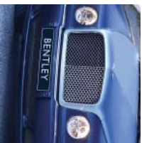
DUO TONE PAINT COMBINATION