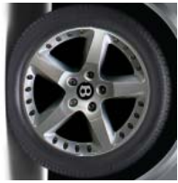
17" 5-SPoke 2-PIECE SPORTS BLADE ALUMINUM ALLOY (PAINTED)