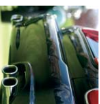
REAR SPORTS BLOWER AND QUAD EXHAUST TAIL PIPE FINISHERS