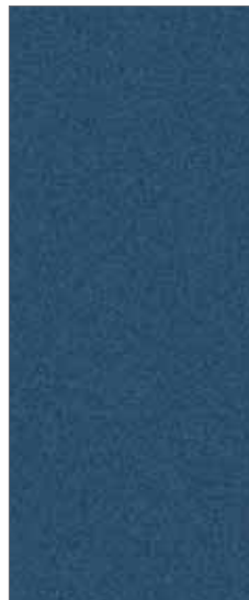
Norsea Blue Metallic