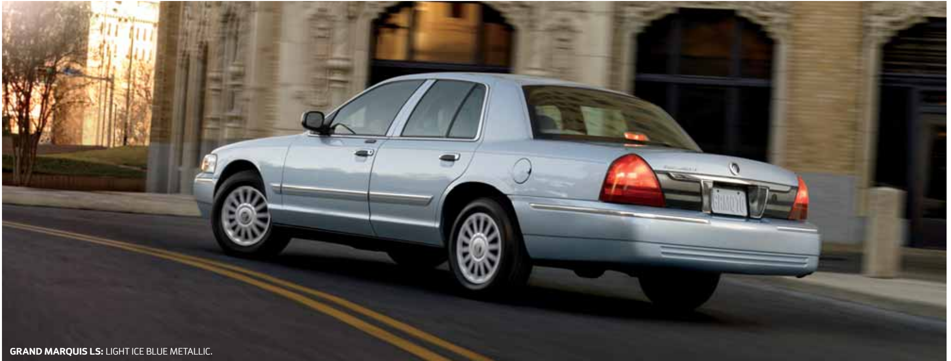
GRAND MARQUIS LS: LIGHT ICE BLUE METALLIC.