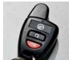
Remote start systems

To learn more about Mercury Custom Accessories and to buy them online, visit mercuryaccessories.com .