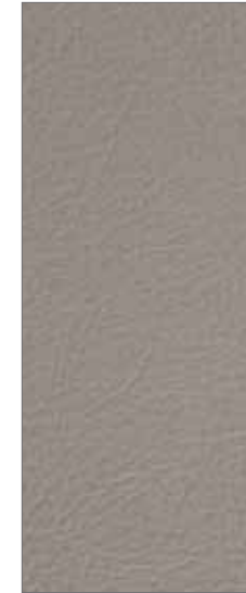
Medium Light Stone Leather 1