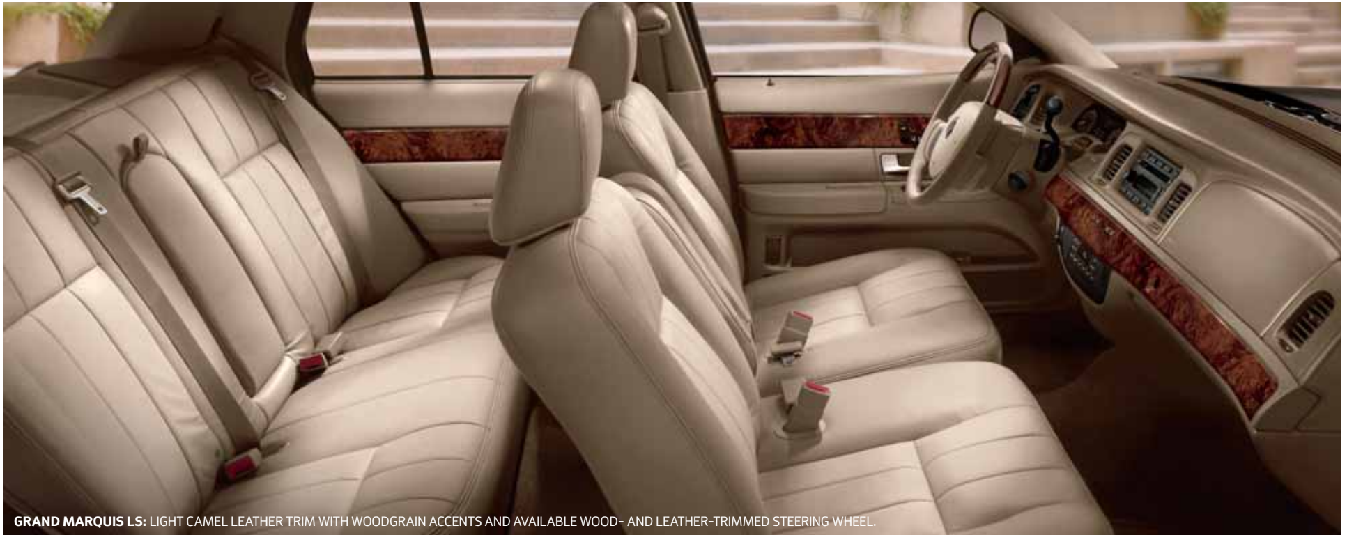
GRAND MARQUIS LS: LIGHT CAMEL LEATHER TRIM WITH WOODGRAIN ACCENTS AND AVAILABLE WOOD- AND LEATHER-TRIMMED STEERING WHEEL.