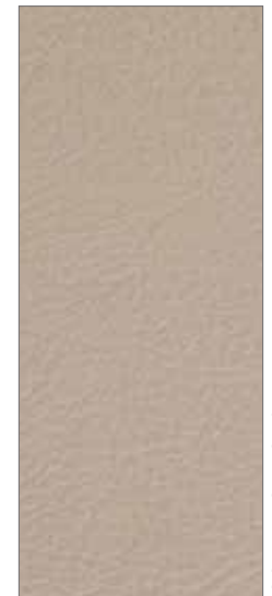
Light Camel Leather 2