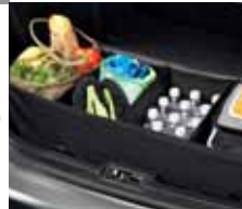
Interior soft cargo organizer (large size)