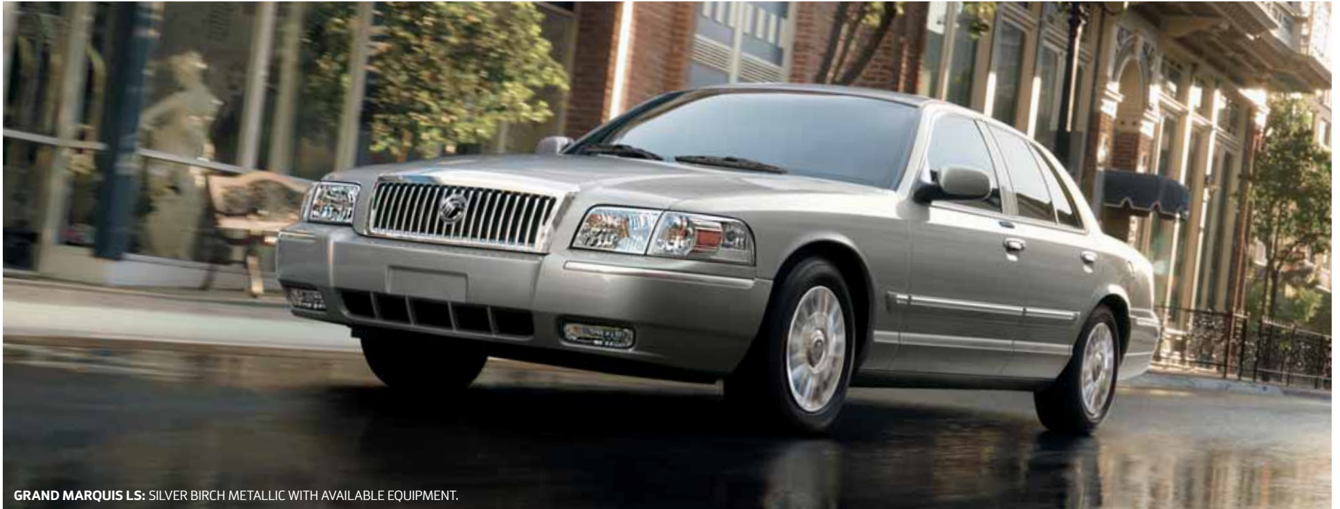
GRAND MARQUIS LS: SILVER BIRCH METALLIC WITH AVAILABLE EQUIPMENT.