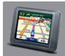
Garmin® portable navigation systems 1