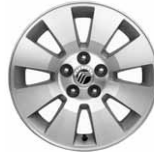
17" MACHINED-ALUMINUM WHEELS Standard on Mountaineer