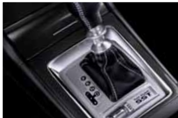
RALLIART with TC-SST and AWC