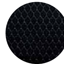
Black Premium Sports Fabric Geometric Print Trim RALLIART