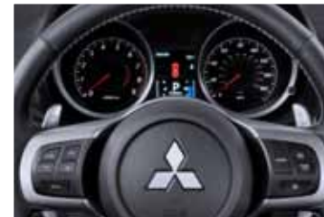
Full-Color Multi-Information Display