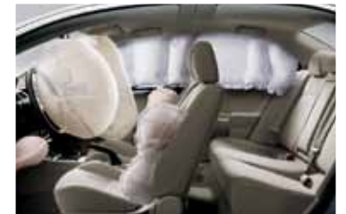
Seven Standard Airbags