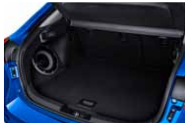
Up to 52.7 Cubic Feet of Cargo Space