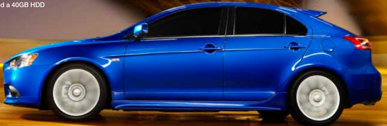
Lancer Sportback RALLIART in Octane Blue

Beyond its spacious cargo hold and sporty European influenced styling, the Lancer Sportback offers all the great performance and safety features its respected family is known for. That means available TC-SST, AWC, seven standard airbags 1 and a 40GB HDD navi/music server, for unlimited fun on the road.