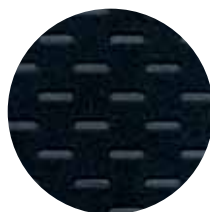
Black Sports Fabric Geometric Print Trim GTS