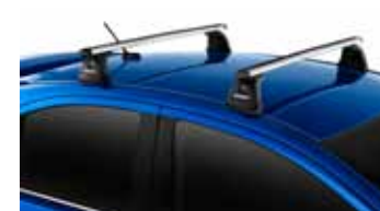
Roof Rack Kit