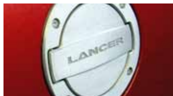
Alloy Fuel Door