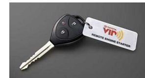
Remote Start $529 Installed MSRP*