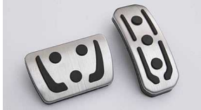
Sport Pedals by OBX Racing $85 Installed MSRP*