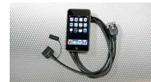
iPod® Interface $299 Installed MSRP*