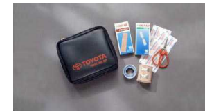
First Aid Kit $29 Installed MSRP*