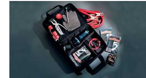
Emergency Assistance Kit $70 Installed MSRP*