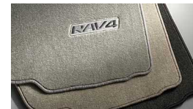
Carpet Floor Mats/Cargo Mat $199 Installed MSRP*