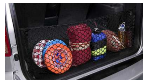
Cargo Net $49 Installed MSRP*