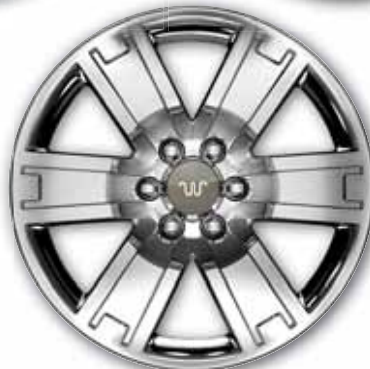
20" Chrome-Clad Aluminum with King Ranch Center Cap Optional on King Ranch

New Vehicle Limited Warranty. We want your Ford Expedition or Expedition EL ownership experience to be the best it can be. So under this warranty, your new vehicle comes with 3-year/36,000-mile Bumper-to-Bumper Coverage, 5-year/60,000-mile Powertrain Warranty Coverage, 5-year/50,000-mile Safety Restraint Coverage, and 5-year/unlimited-mile Corrosion (Perforation) Coverage – all with no deductible. Please ask your Ford Dealer for a copy of this limited warranty.