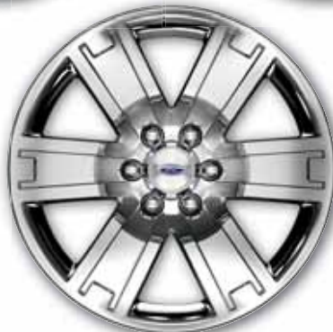
20" Chrome-Clad Aluminum Optional on Eddie Bauer and Limited