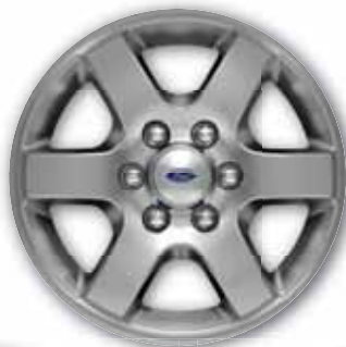
17" Aluminum Standard on XLT