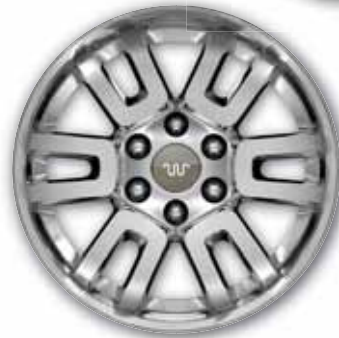
18" Machined-Aluminum with King Ranch® Center Cap Standard on King Ranch