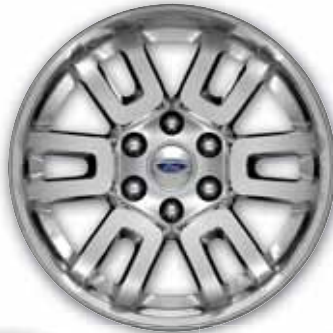
18" Machined-Aluminum Standard on Eddie Bauer®