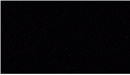
Panther Black Metallic 1