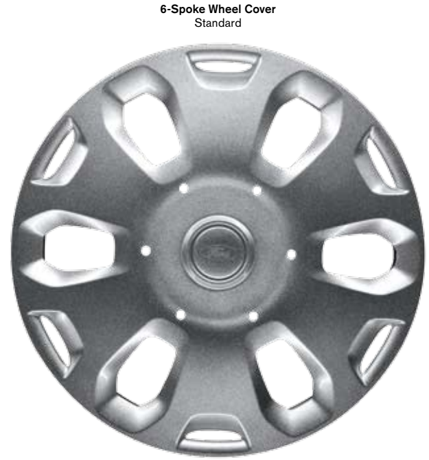
6-Spoke Wheel Cover Standard