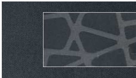
Cloth - Grey Standard