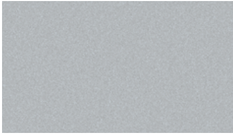
Silver Metallic 1