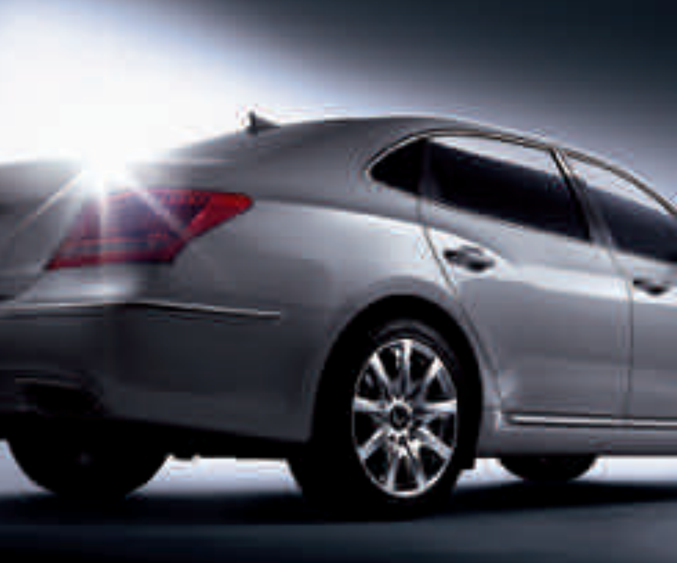
EQUUS IN PLATINUM METALLIC