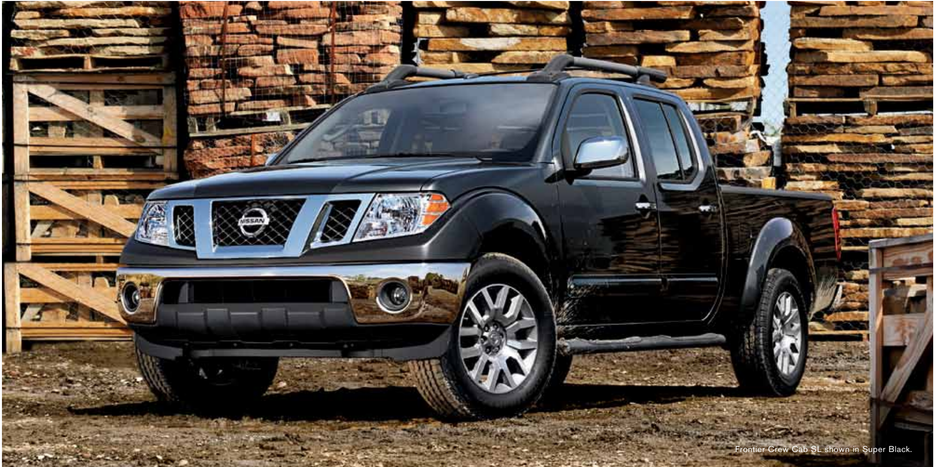
Frontier Crew Cab SL shown in Super Black.