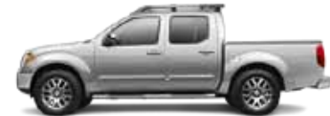
SL: CREW CAB