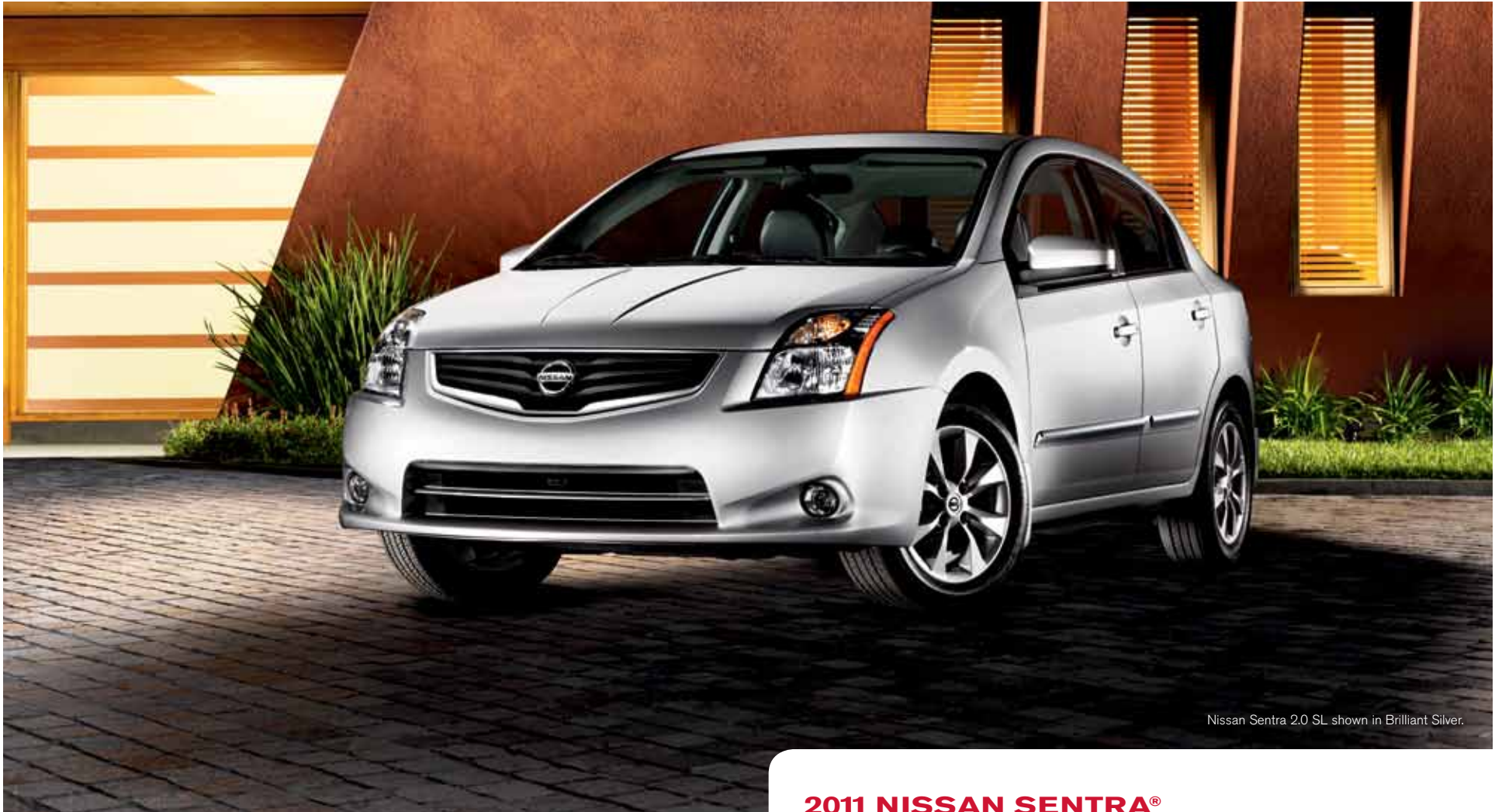
Nissan Sentra 2.0 SL shown in Brilliant Silver.