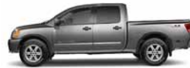
PRO-4X KING CAB AND CREW CAB