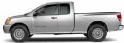
S KING CAB AND CREW CAB