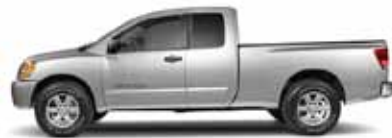
SV KING CAB AND CREW CAB