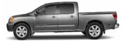
SL CREW CAB