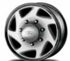
16-in. Steel Wheels with Sport Wheel Covers Standard

Power Code is a trademark of Code Systems, Inc.