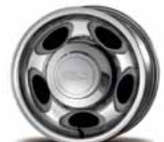
16-in. Aluminum Wheels Available

© 2010 Ford Motor Company 11ESRJ2WEBPDFSPEC