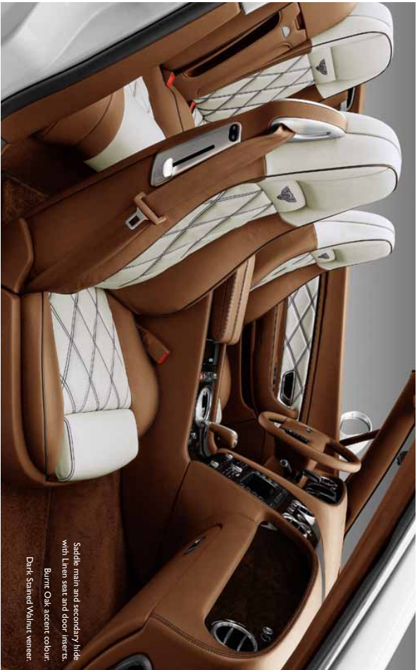
Saddle main and secondary hide with Linen seat and door inserts. Burnt Oak accent colour. Dark Stained Walnut veneer.