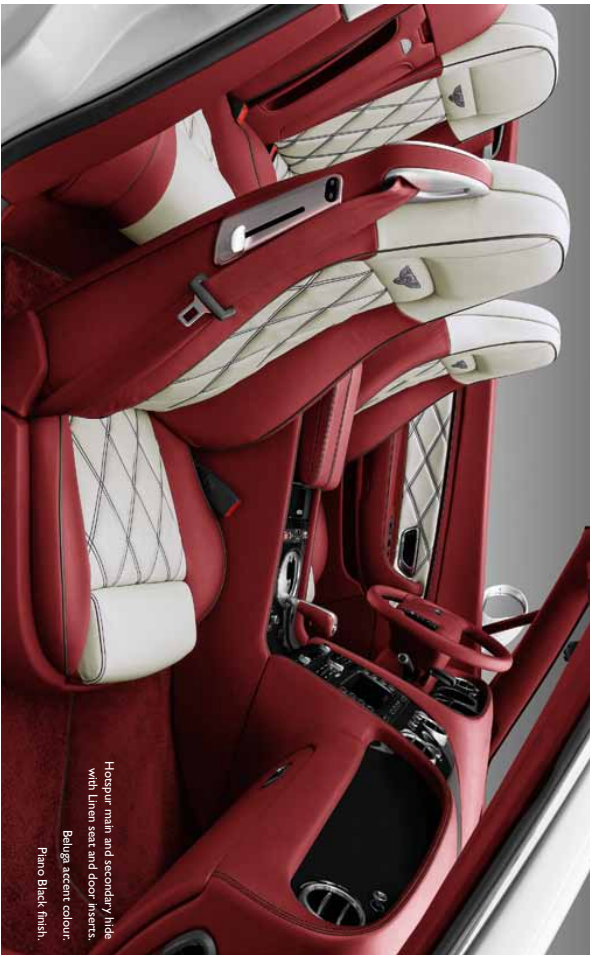
Hosepur main and secondary hide with Linen seat and door inserts. Beluga accent colour. Plano Black finish.