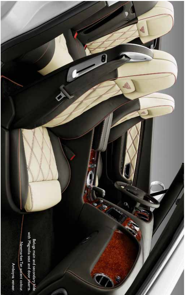
Beluga main and secondary hide with Fighola seat and door inserts. Newmarket Tan accent colour. Ambyra veneer.