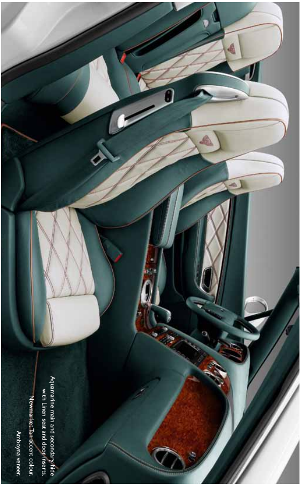
Aquamarine main and secondary hide with Linen seat and door risers. Newmarket Tan accent colour. Anthonys veneer.