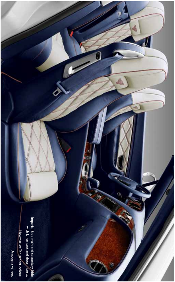
Imperial Blue main and secondary hide with Linen seat and door inserts. Newmarket Tan accent colour. Ambyra veneer.