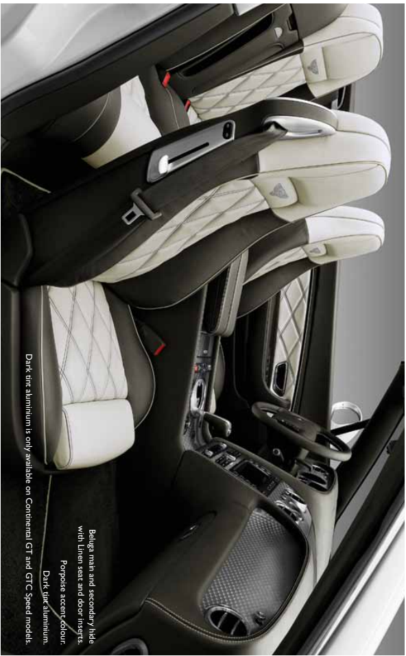
Beige main and secondary hide with Linen seat and door risers. Peropose accent colour. Dark tint aluminium. Dark tint aluminium is only available on Continental GT and GT3 Speed models.