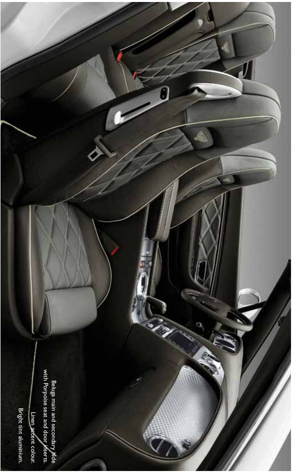
Beige main and secondary hide with Peropose seat and door risers. Linen accent colour. Bright tint aluminium.