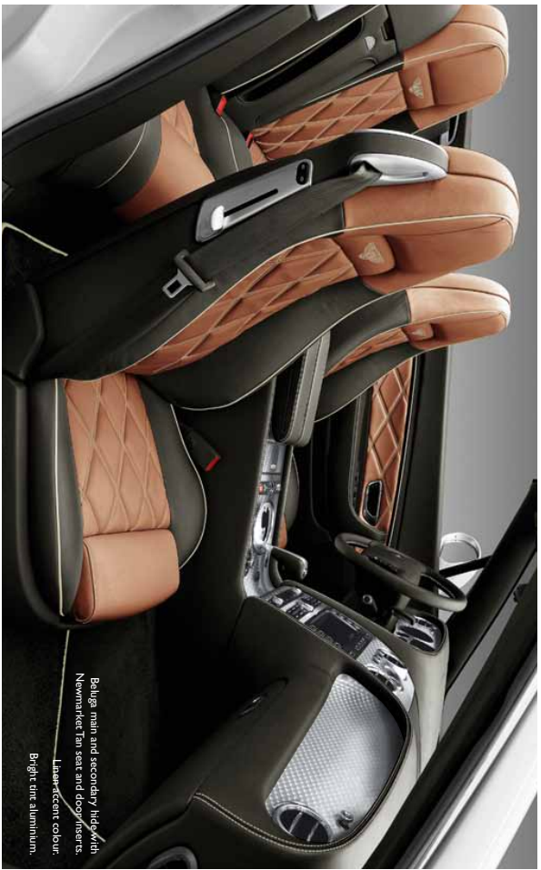
Beige main and secondary hide with Newmarket Tan seat and door risers. Lasee accent colour. Bright tint aluminium.