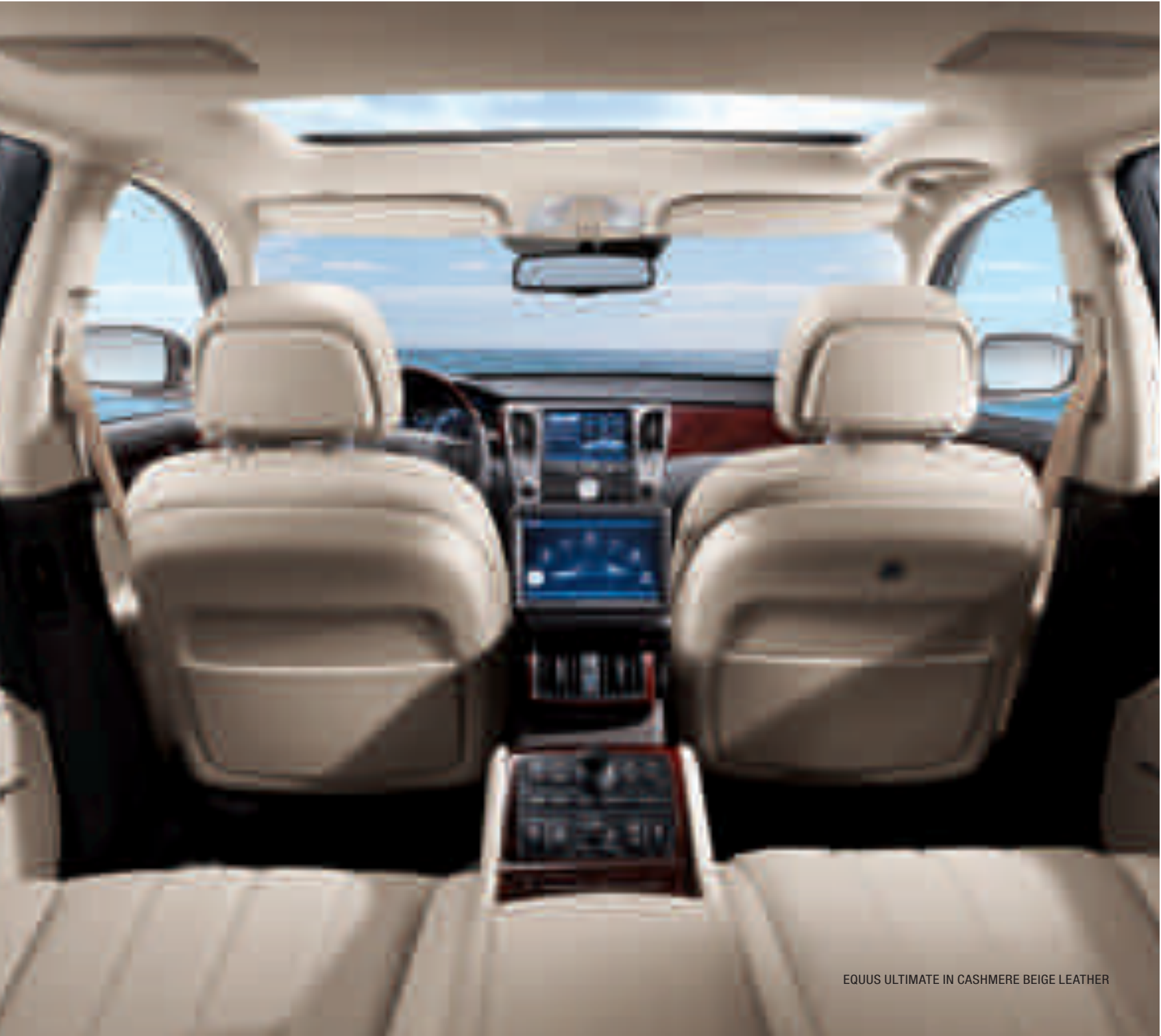
EQUUS ULTIMATE IN CASHMERE BEIGE LEATHER