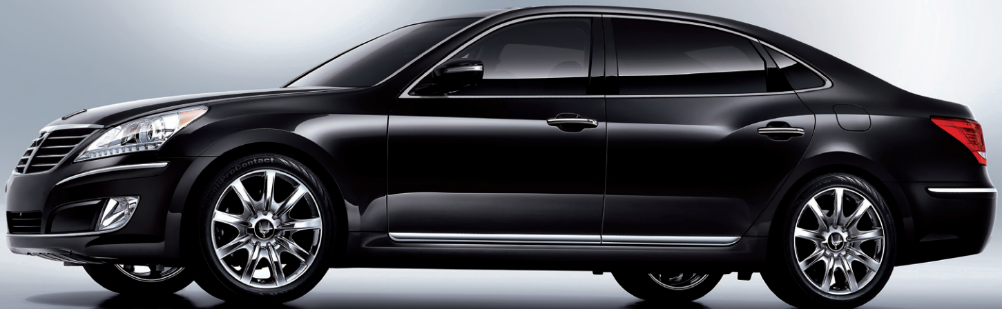
EQUUS ULTIMATE IN BLACK NOIR PEARL

Hyundai backs every car we build with this simple promise: Relax. We've got your back for the next 10 years or 100,000 miles. It's a commitment to customers that's evolved into Hyundai Assurance, an umbrella of services that includes 24/7 Roadside Assistance and more. Visit www.hyundaiassurance.com for details.