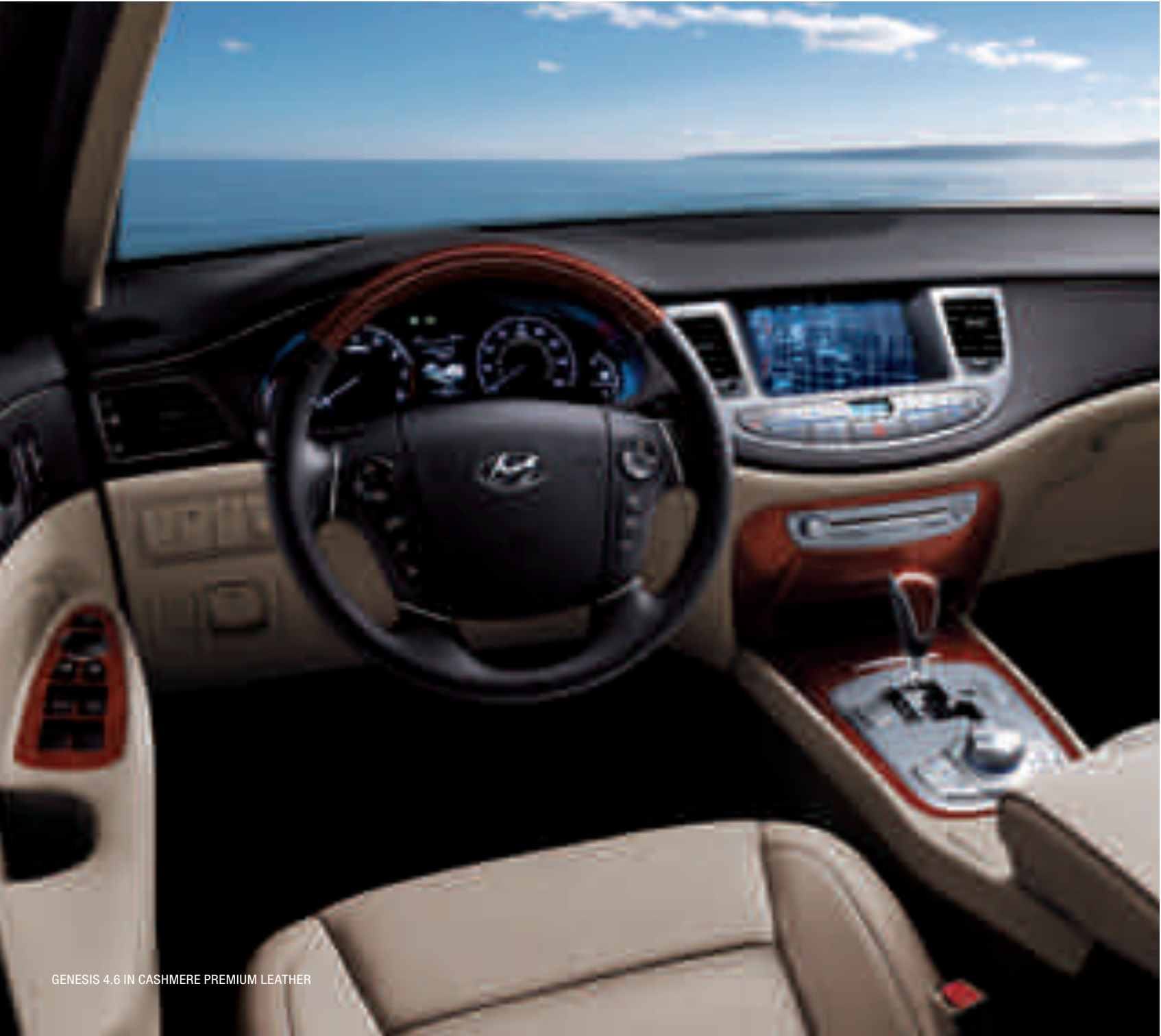
GENESIS 4.6 IN CASHMERE PREMIUM LEATHER