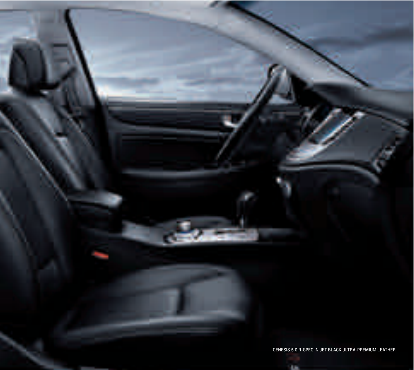
GENESIS 5.0 R-SPEC IN JET BLACK ULTRA-PREMIUM LEATHER