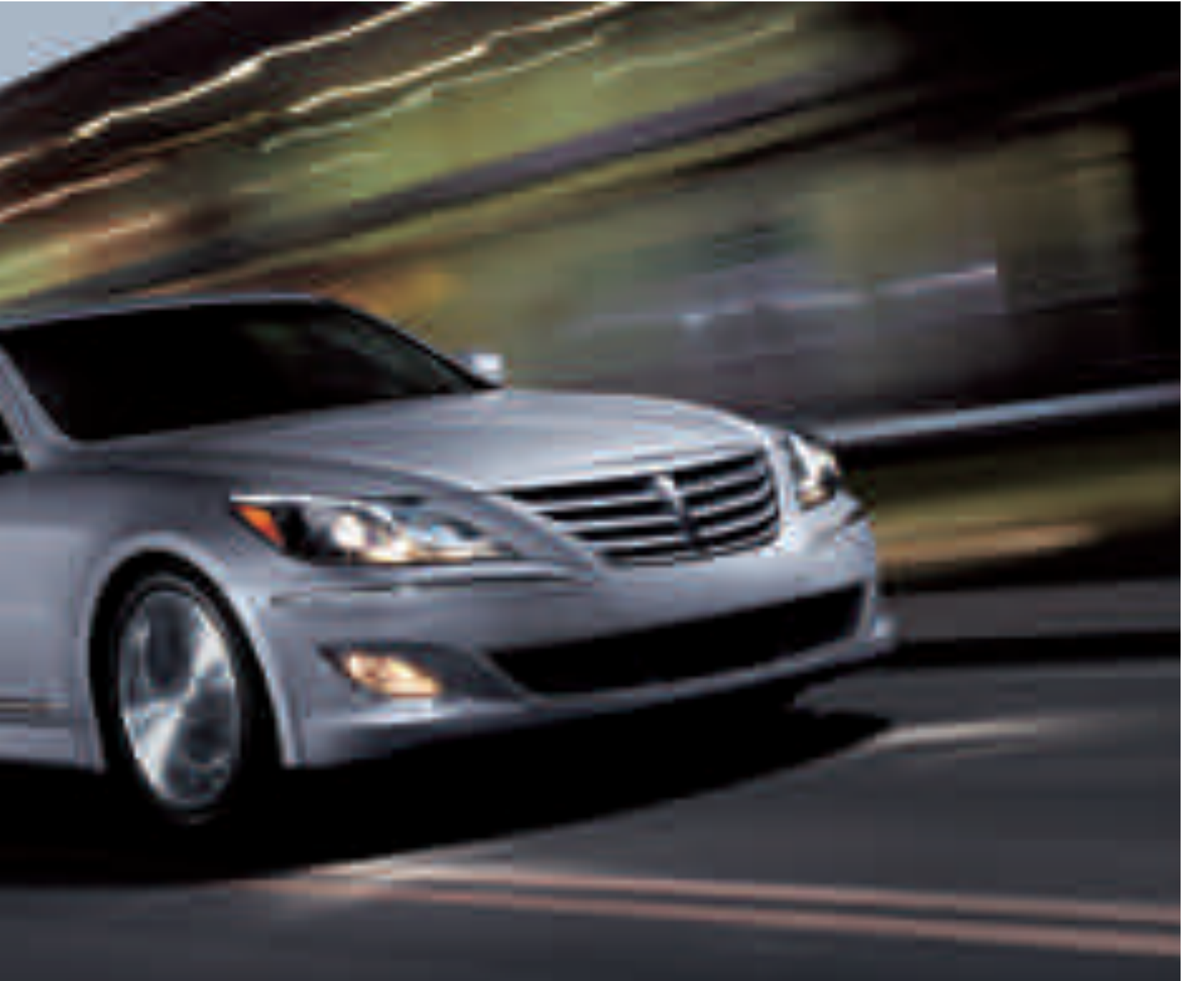
GENESIS 5.0 R-SPEC IN PLATINUM METALLIC