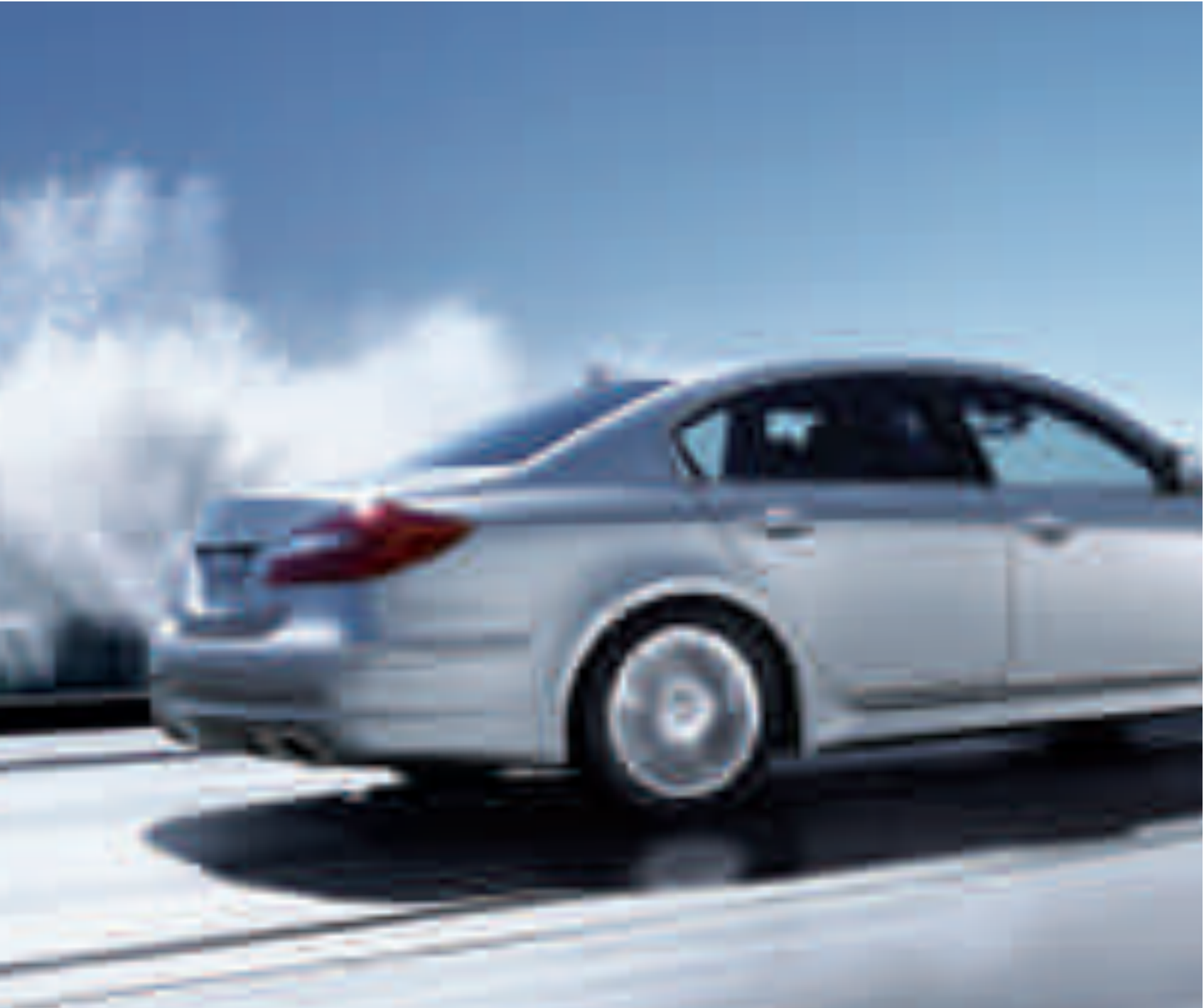
GENESIS 4.6 IN PLATINUM METALLIC