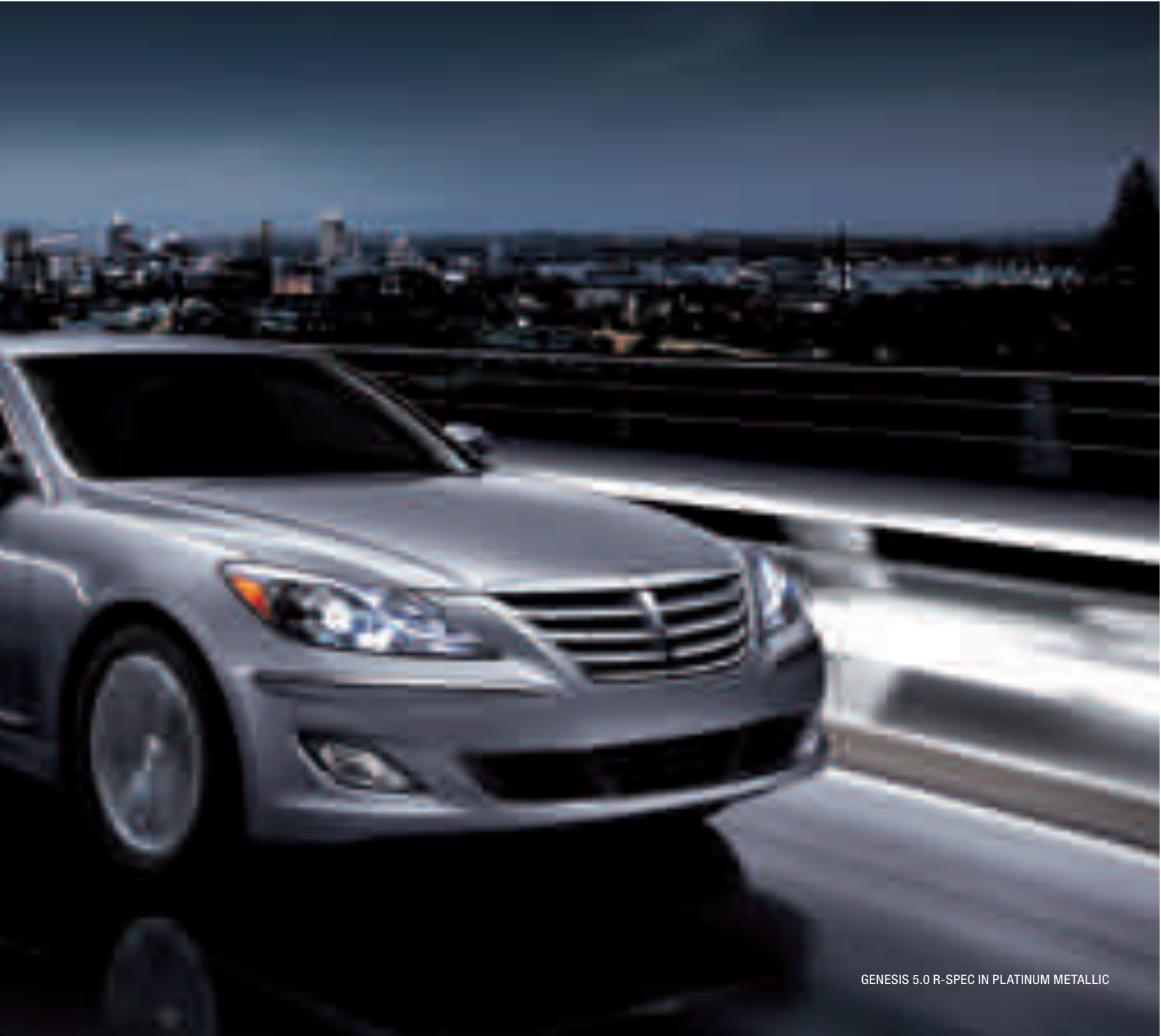
GENESIS 5.0 R-SPEC IN PLATINUM METALLIC