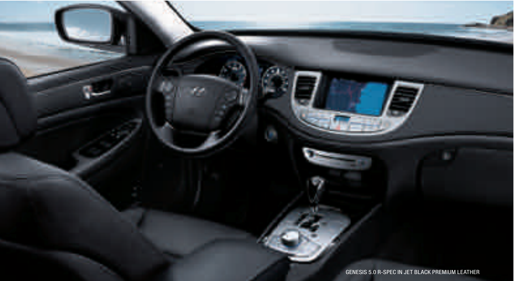
GENESIS 5.0 R-SPEC IN JET BLACK PREMIUM LEATHER