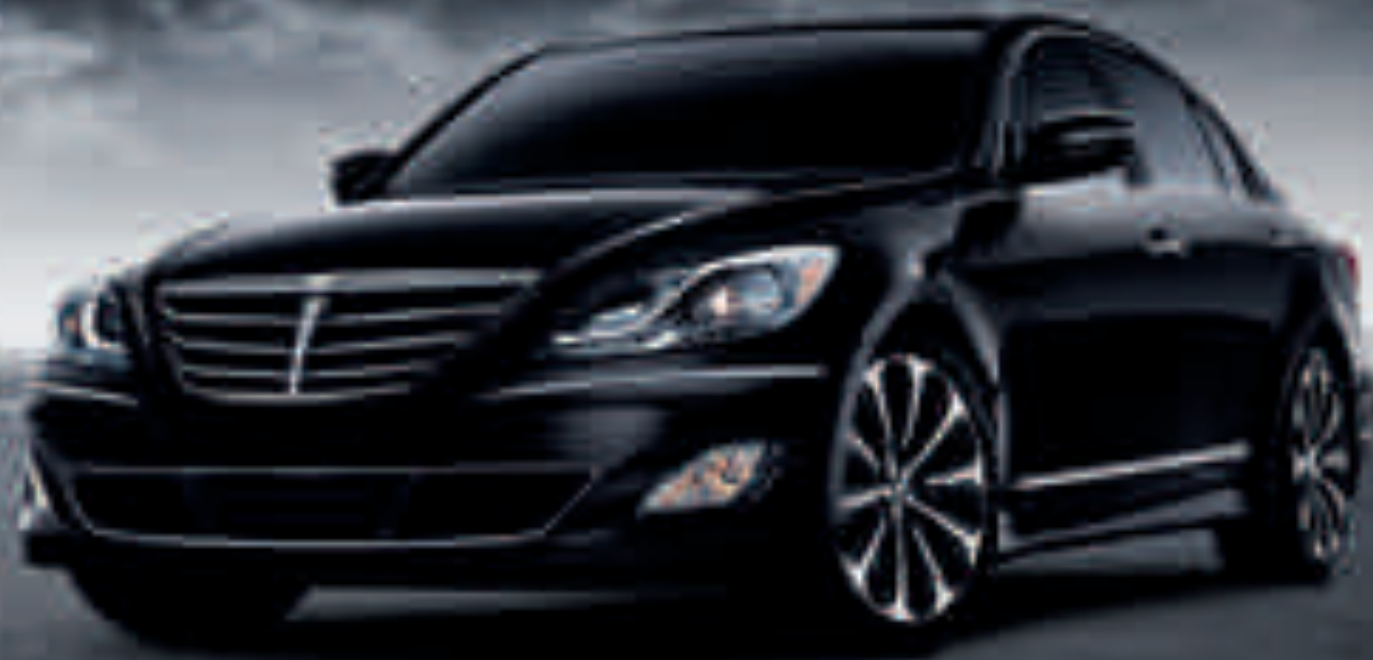
GENESIS 5.0 R-SPEC IN BLACK NOIR PEARL