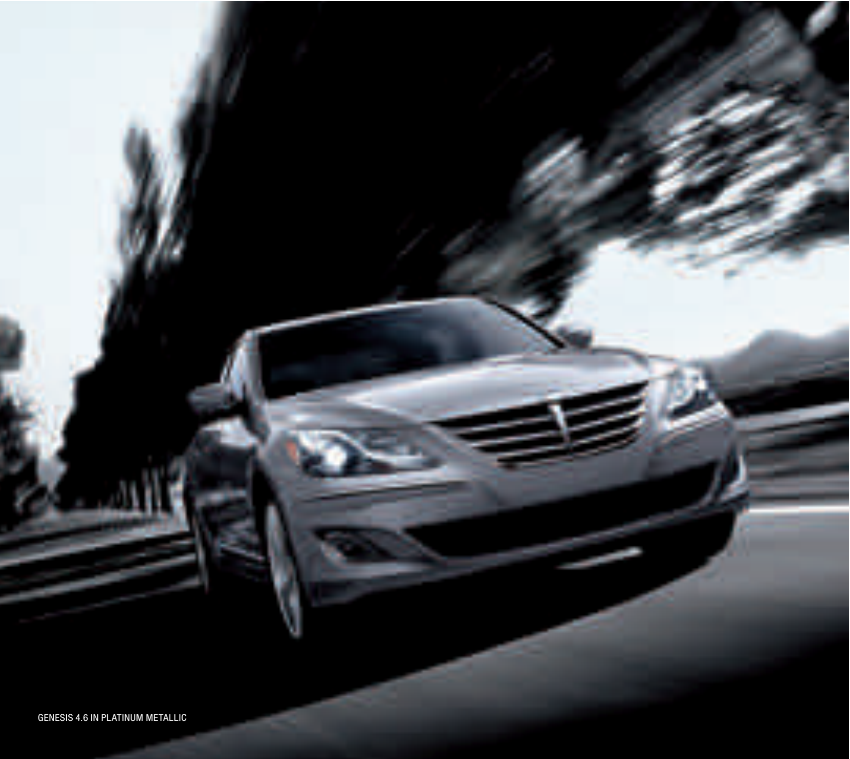
GENESIS 4.6 IN PLATINUM METALLIC