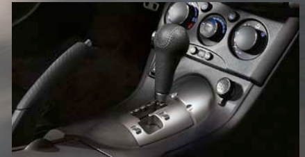
Sportronic® Automatic Transmission