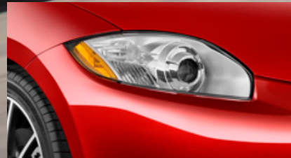
HID Projector-type Headlamps