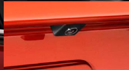
Rear-view Backup Camera