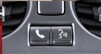
Bluetooth® Hands-Free System