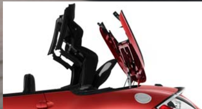
Powered Hard Tonneau Cover