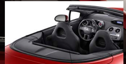
19-second Power Folding Top with Full Cloth Liner