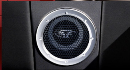
650-watt Rockford Fosgate® Audio System