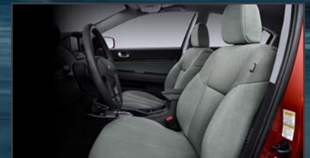
Heated, Power Seats