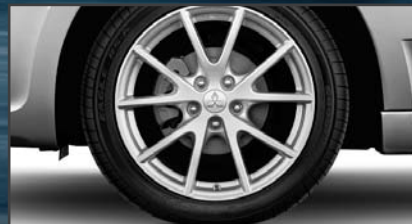
18-inch Alloy Wheels