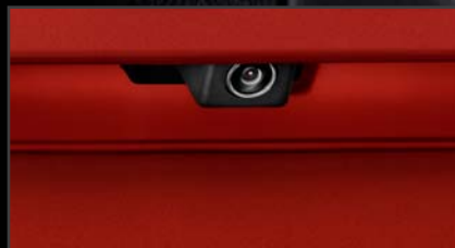
Touch-screen Navigation with Rear-view Backup Camera