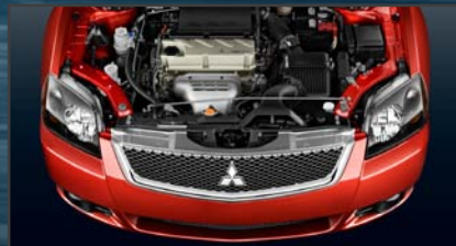
Fuel-efficient MIVEC Engine