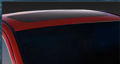
Power Glass Sunroof