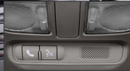
Bluetooth® Hands-free System