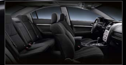
Six Standard Airbags