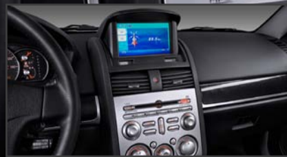
Rockford Fosgate® Acoustic Design® Audio System