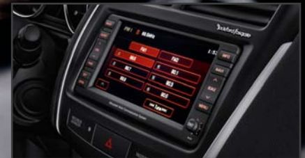
FUSE Hands-free Link System™