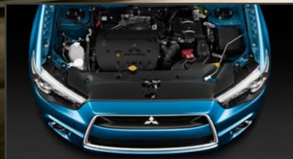
Powerful and fuel-efficient MIVEC engines