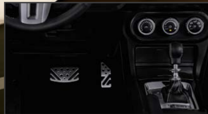
CVT with available Sportronic® shifting and magnesium paddle shifters