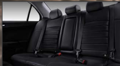
One-touch folding rear seats