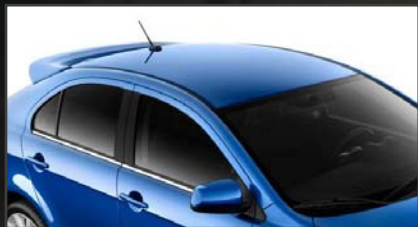
Plug-in Thule® roof rack sockets