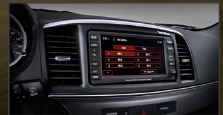
140-watt CD/MP3 audio system with DSP control