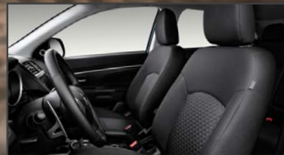
Seven-airbag safety system 2