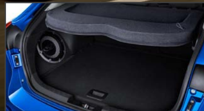
Up to 52.7 cubic feet of cargo space