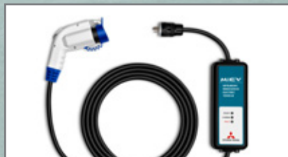
Standard Level 1 (120V) portable charging cable 4