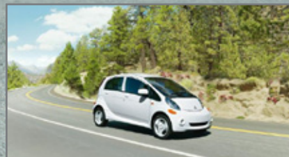
Brake energy regeneration system