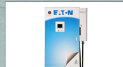
Available Level 3 (CHAdeMO) public quick-charge port