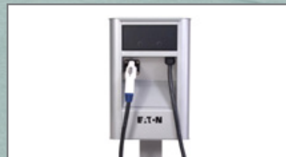
Optional Level 2 (240V) EVSE home charging dock