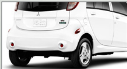
No tailpipe, zero on-road emissions