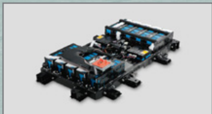
Custom Mitsubishi 16 kWh battery pack