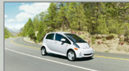
Ranked "Greenest Vehicle of 2012" by ACEEE