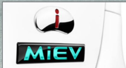
MiEV (Mitsubishi Innovating Electric Vehicle) technology