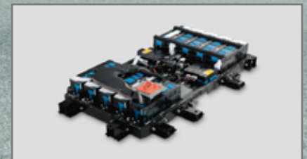
8-year/100,000-mile main drive lithium-ion battery limited warranty