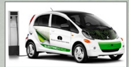
Most affordable EV in America 2