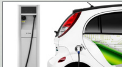
EPA-leading 112 MPGe 1