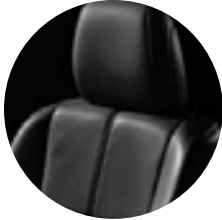
Black Leather Trim

We created a space that would adapt to your needs. We put the driver at the center of everything: Welcoming seats, intuitive technology and spacious design — all with a premium feel. This is a new era in the art of making cars.