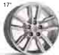
17" XLE and XLE Premium alloy wheel