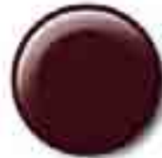
Sizzling Crimson Mica