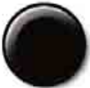
Attitude Black Metallic

Engineering doesn't start and stop under the hood. Avalon's exterior has been redesigned to the wheelwells. With a wide range of colors and trims, no matter what your preference, your Avalon will look just as great as it drives.