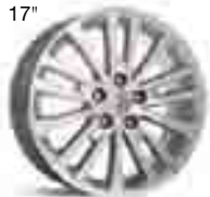
17" Hybrid alloy wheel