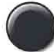
Magnetic Gray Metallic