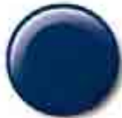
Nautical Blue Metallic