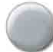
Classic Silver Metallic