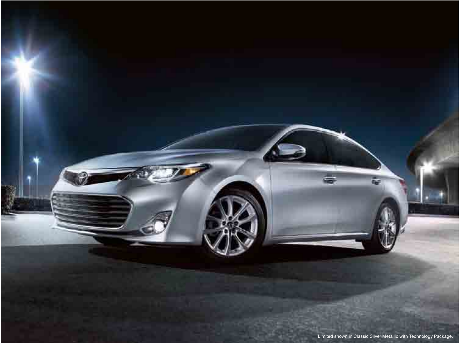
Limited shown in Classic Silver Metallic with Technology Package.