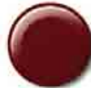
Moulin Rouge Mica