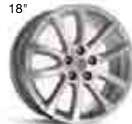
18" XLE Touring and Limited alloy wheel