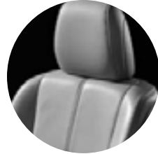
Gray Leather Trim

Plush leather options The Avalon offers several leather choices including Limited and Hybrid Limited with premium perforated leather.