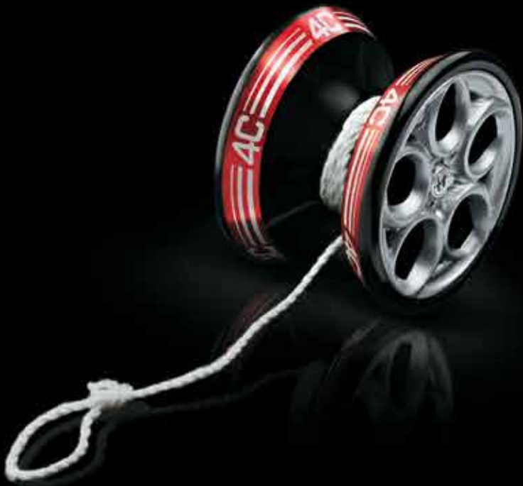
Competition yo-yo Made of aluminum turned from a solid piece and with ball bearing inside. Alfa Romeo 4C wheel shape. Difficulty: medium.