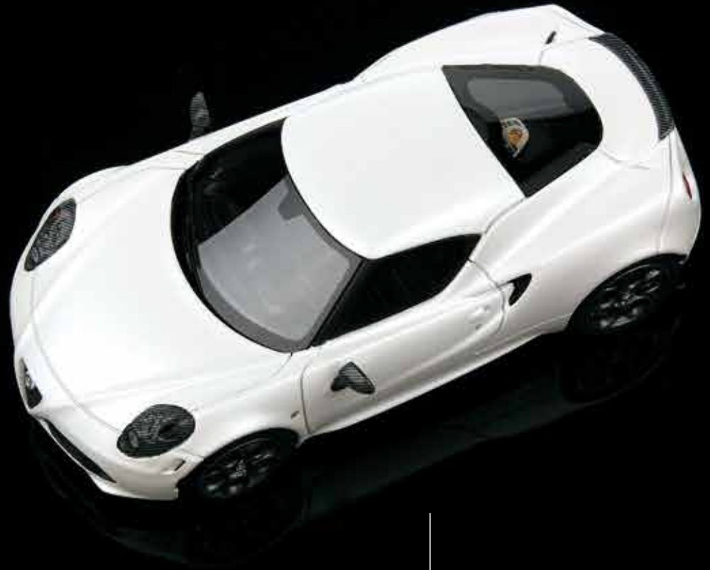
4C model car 1:43 scale model car