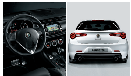
Driver focused technology