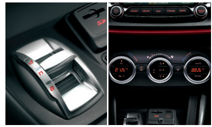
Alfa D.N.A. (standard)