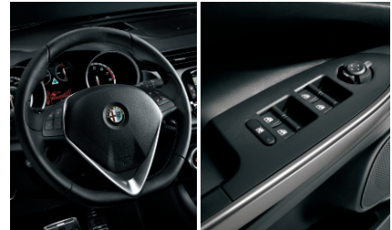
Flat bottomed sports leather steering wheel with white stitching