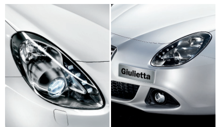
Bi-Xenon adaptive front headlights with headlight washer system