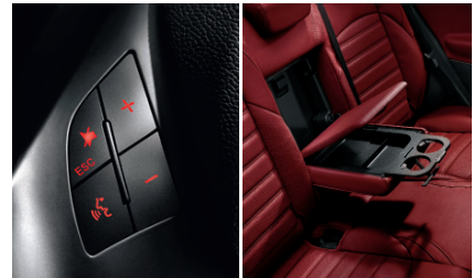
Radio controls on steering wheel (standard)