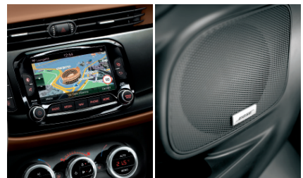
Uconnect™ 6.5" Radio Nav