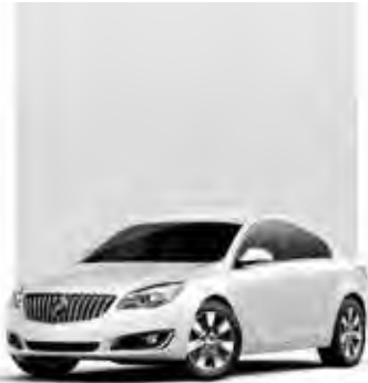
SUMMIT WHITE 1