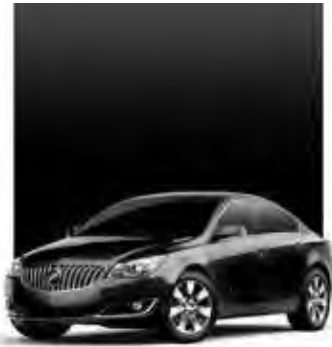
BLACK ONYX 1