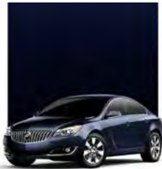
DARK SAPPHIRE BLUE METALLIC 1,2