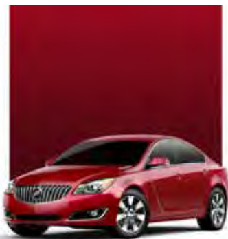
CRIMSON RED TINTCOAT 2,3