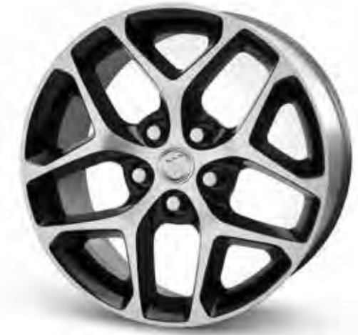
PTW 18" ALLOY WITH BLACK POCKETS (SPORT TOURING MODEL ONLY)