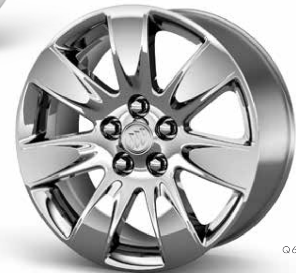
Q6Y 18" CHROMED ALLOY