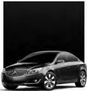
EBONY TWILIGHT METALLIC 2,3