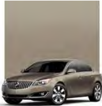
PEPPERDUST METALLIC 1,2,3