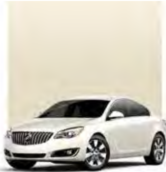
WHITE FROST TRICOAT 2,3