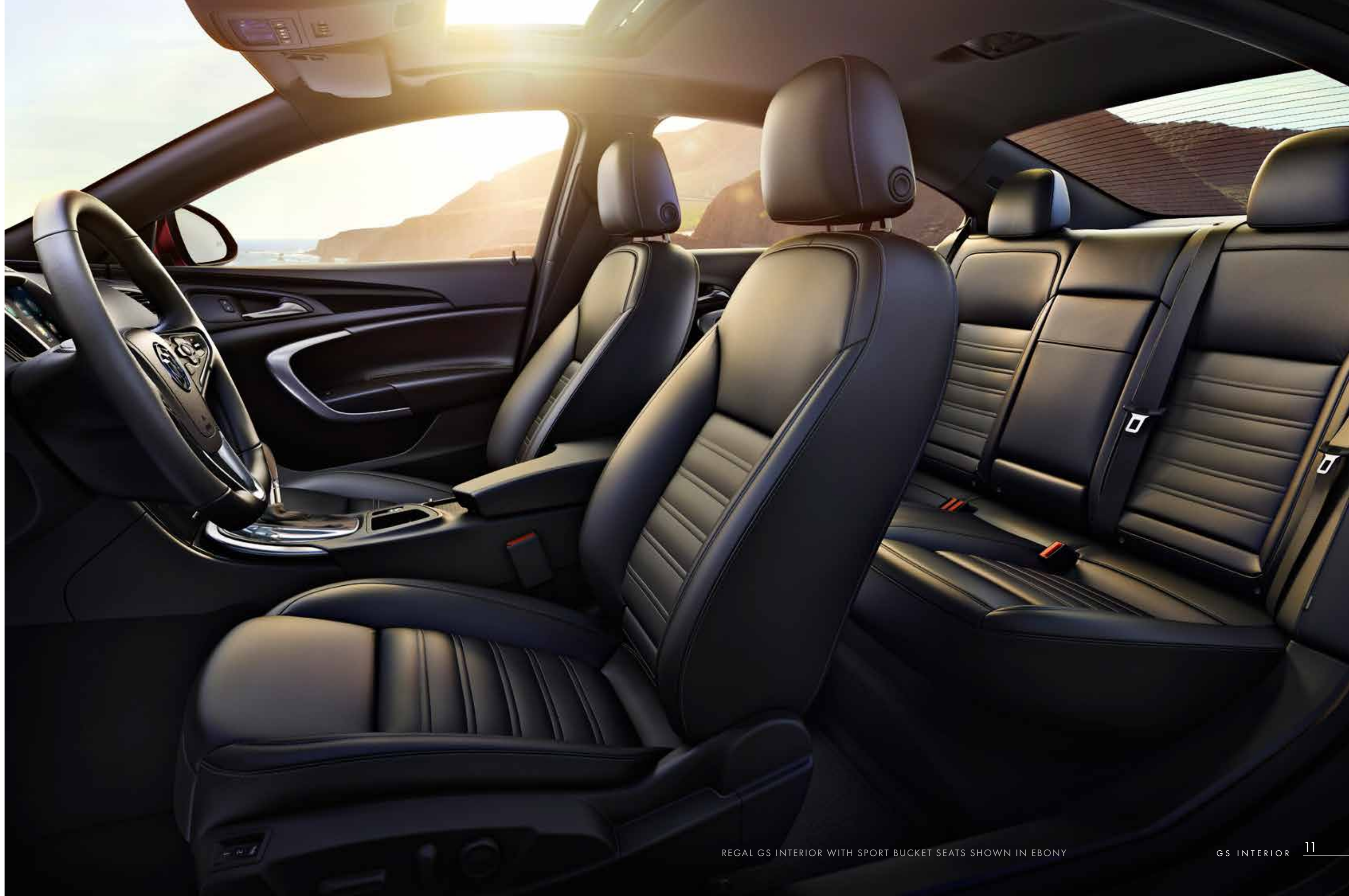
REGAL GS INTERIOR WITH SPORT BUCKET SEATS SHOWN IN EBONY