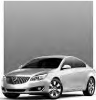
QUICKSILVER METALLIC 2