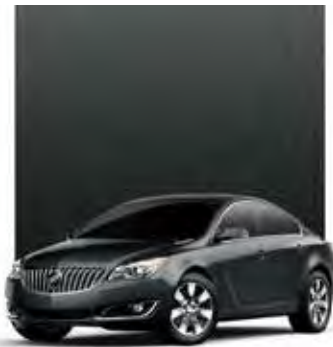
GRAPHITE GRAY METALLIC 2,3