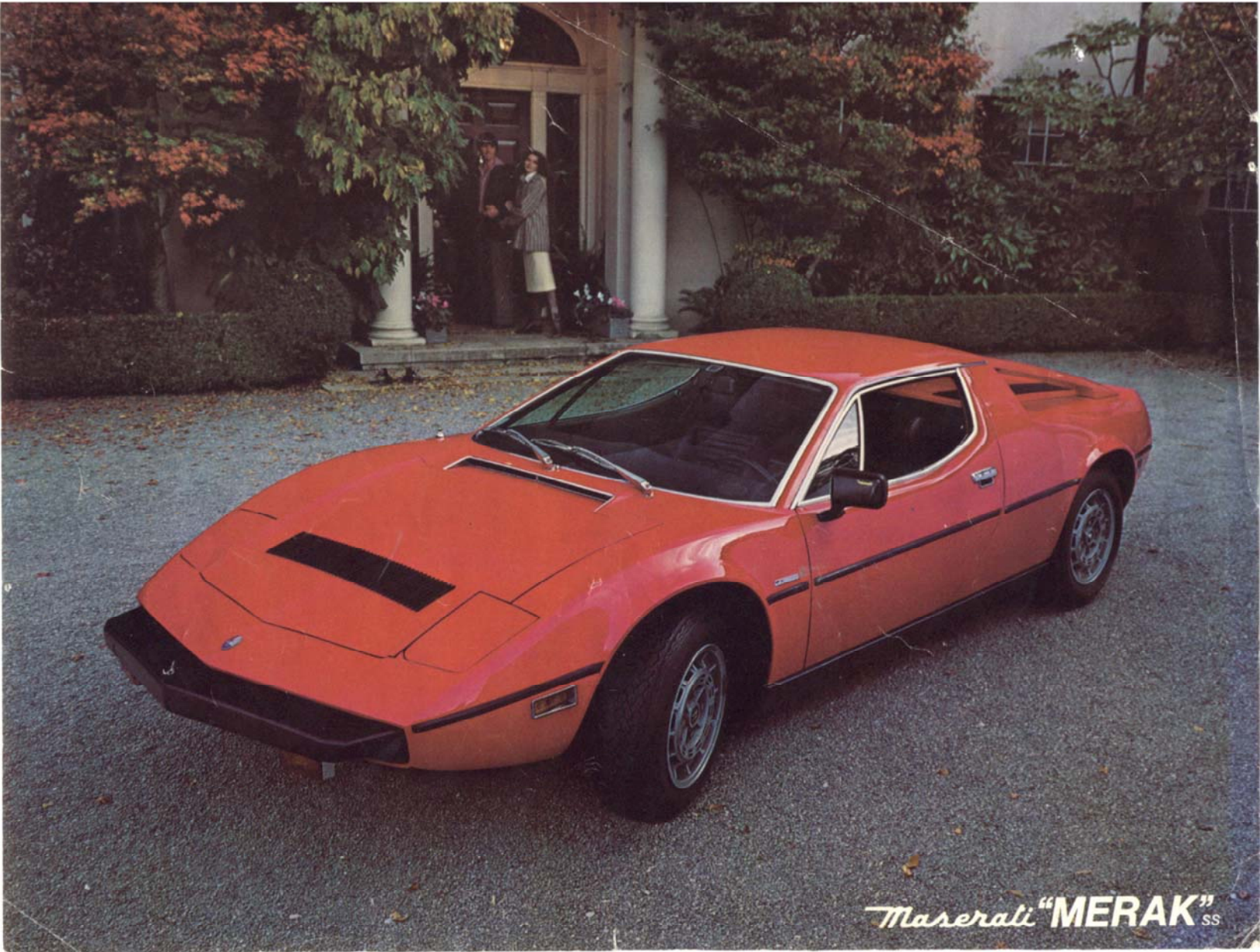
Maserati "MERAK" SS